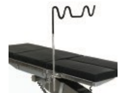
DSC-611 Single Picket Fence Leg Holder Preps both legs at once Adjustable Height up to 30" Stainless Steel w/Rubber Coated Top Requires 1 Clark Socket (BD-CS)