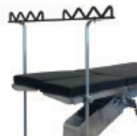
DSC-610 Double Picket Fence Leg Holder Preps both legs at once Adjustable Height up to 30" Stainless Steel w/Rubber Coated Top Requires 2 Blade Clamps (BD-BC)