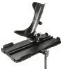
DSC-2620 Stulberg Leg/Knee Positioner Aluminum Footplate Includes 3 Disposable Sterile Pads