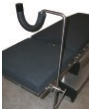
DSC-SLPS Single Loop Leg Prepper Includes Pad (Requires 1 Clark Socket BD-CS)