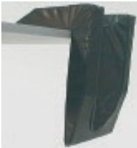
BB-WLH Well Leg Holder Foam/Reusable Each