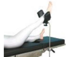
DSC-800-0161 Universal Leg Prepper (Requires 1 Clark Socket BD-CS) Each