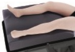
DSC-FROGGER Vein Harvesting Positioner Foam/Reusable Each