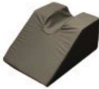
BB-EPP Extremity Positioner Foam/Reusable Each