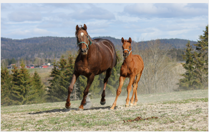
Pindrop with one of her previous foals (c. Evasive) at Saltvedt Gård in 2020.