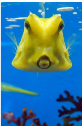
Longhorn cow fish