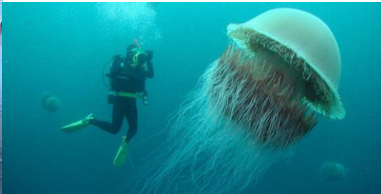
lion's mane jellyfish