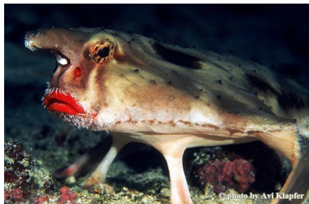
red lipped batfish