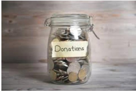
Donations can be made directly from the home page of our ALTD website.