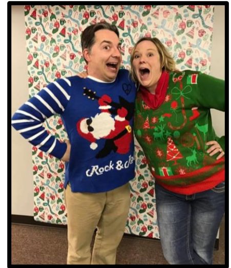
With these two at the helm, Weekend #36 is sure to be a joy!!

Would you be interested in being a ALTD Prayer Warrior?