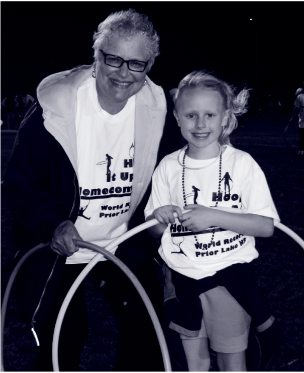
World's Largest Hula Hoop Contest PLHS Homecoming 2011

Laker Hall of Fame Co-sponsor and administer funds from dedicated events, to recognize exceptional individuals in Athletics, Activities and Academics from PLHS, and others who have given extensive time and vastly improved the programs within ISD719.