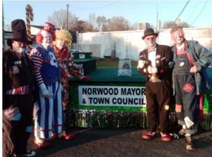
Is this the Norwood City Council?