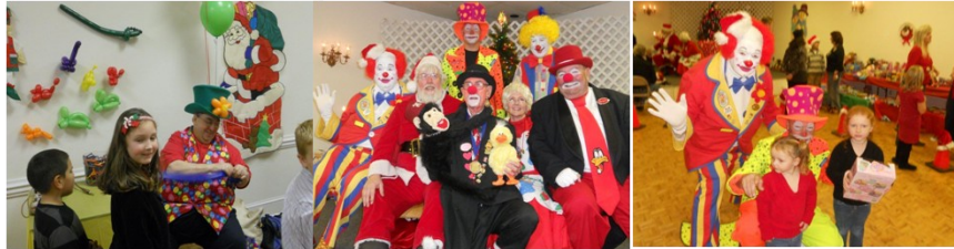
Oasis Clowns entertain at the Mecklenburg Shrine Club Santa Day.

The holidays are among the most active for the Oasis Clown Unit. Beginning with the annual International Car Show at the Charlotte Convention Center,