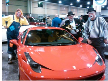
Clowns tried to buy a 2012 Ferrari.