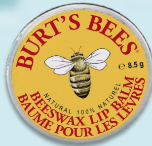
Burt's Bees Beeswax Lip Balm