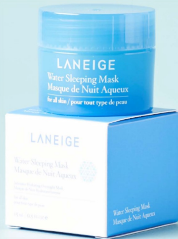
Laneige Water Sleeping Mask