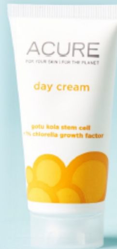
Acure Day Cream