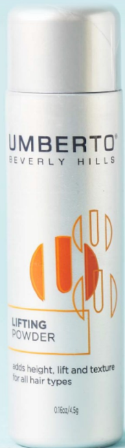
Umberto Lifting Powder