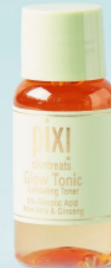
Pixi Glow Tonic