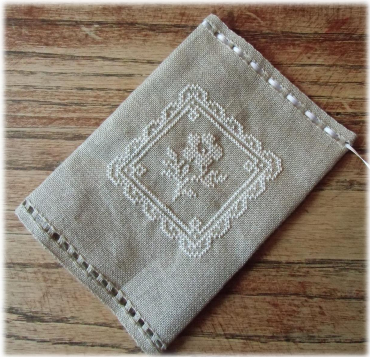
Stitched in white on natural linen