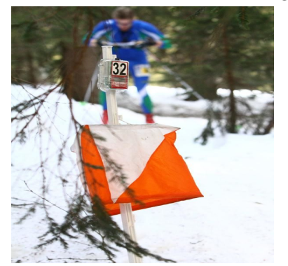
Ski O Ready to go