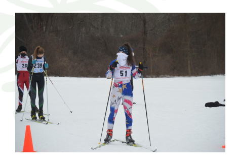
Lets get out there an race!!