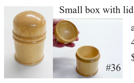
ash 4" tall $29.