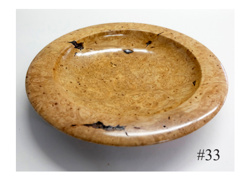
maple burl, top diameter 131/4" base diameter 41/8" $75.