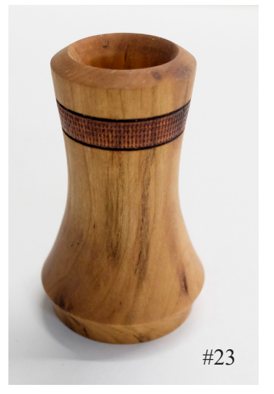
Pencil holder with patterned ring white birch top diameter 1<sup>3</sup>/<sub>4</sub>" base diameter 2" height 6"