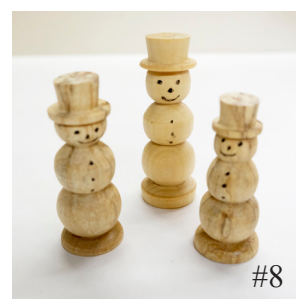
Snowmen Group A $10.

Snowmen in sets maple heights 31/4" to 41/2"