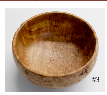
Reddish Bowl, #3 lightweight maple burl top diameter 5<sup>3</sup>/<sub>4</sub>" base diameter 2<sup>3</sup>/<sub>4</sub>" height 3" $30.