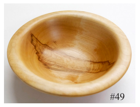
Bowl river birch diameter 7<sup>3</sup>/<sub>4</sub>" height 2<sup>1</sup>/<sub>4</sub>" $45.