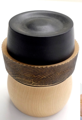
Two-tone box with lid maple, with dyed black top and inside

lid base diameter 3<sup>3</sup>/<sub>8</sub>" body base diameter 3" total height 5"