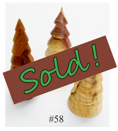
Set D Two-tone trees $20.

Larry Lobel's trees range from 3" to 5" in height.