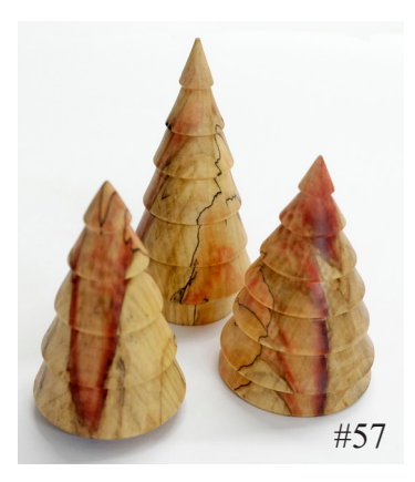
Set C Colors added $20.