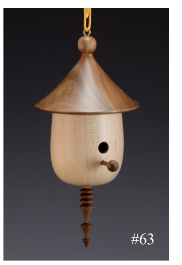
Birdhouse Christmas tree ornament walnut and maple height 5½" $75.