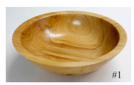
Bowl #1 maple top diameter 7<sup>1</sup>/<sub>4</sub>" base diameter 4" height 2<sup>1</sup>/<sub>4</sub>" $25.