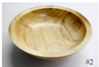
Bowl #2 maple top diameter 8<sup>1</sup>/<sub>2</sub>" base diameter 3<sup>3</sup>/<sub>4</sub>" height 2<sup>3</sup>/<sub>4</sub>" $30.