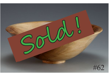
Bowl walnut width 8^{1/2} " height 3" $75.