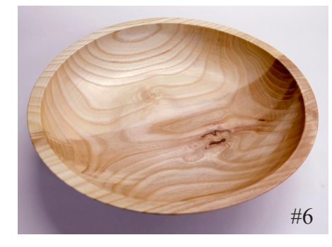
serving Bowl ash top diameter 13" base diameter 71/2" height 23/4" $55.