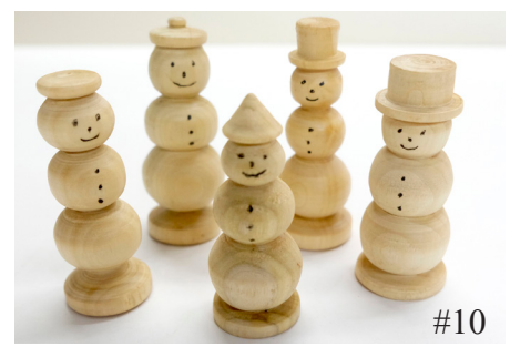
Snowmen Group C $20.