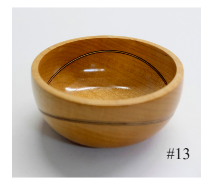
Small bowl w/ decorative line maple top diameter 31/2" base diameter 2" height 11/2" $35.