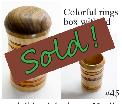
oak lid, ash body 5" tall $29.