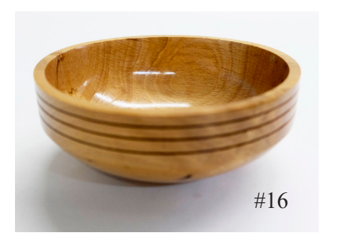
Bowl with three rings spalted beech top diameter 4<sup>3</sup>/<sub>4</sub>" base diameter 1<sup>3</sup>/<sub>4</sub>" height 2" $30.