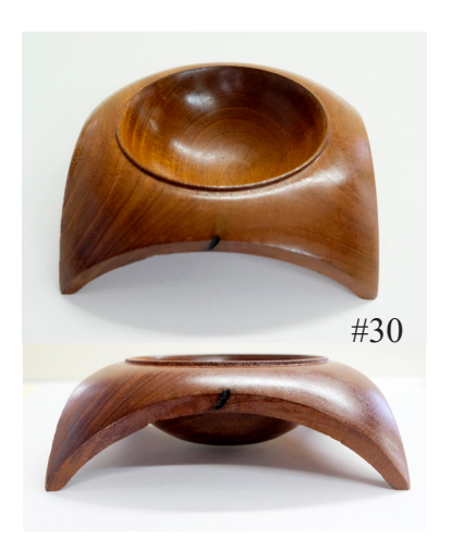
mahogany 7" x 7" 21/2" tall