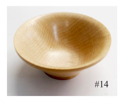
Small "ogee" bowl w/ decorative line maple top diameter 41/2" base diameter 21/8" height 2"