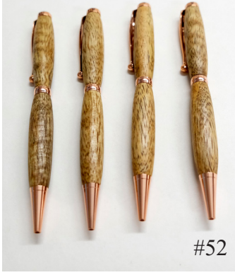
Spalted maple w/copper