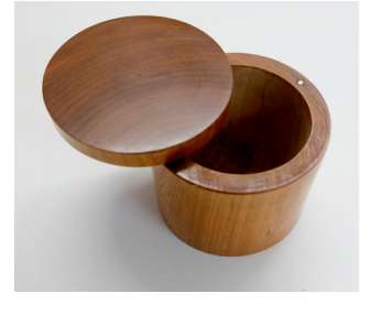
Salt box for cooking (lid stays on w/ magnet) cherry diameter 3^{1/2} " height 3^{1/4} " $35.