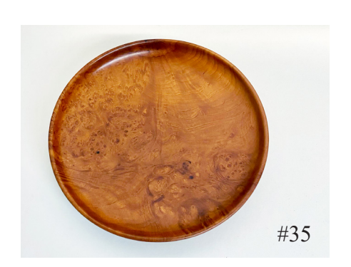
madrone burl, top diameter 101/4" height 13/4" $75.