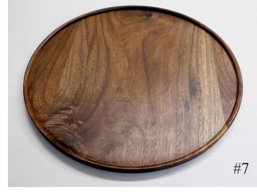
Serving Tray, lightweight walnut diameter 16" $80.