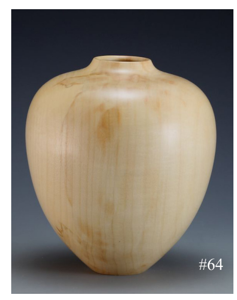
"Hollow form" ash leaf maple top diameter 11/4" width 5" base diameter 13/8" height 61/4"