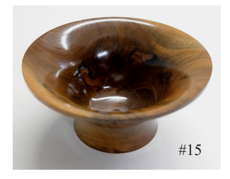
Shiny "ogee" bowl walnut top diameter 57/8" base diameter 31/8" height 3"