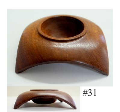
5 <sup>3</sup>/<sub>4</sub>" x 5 <sup>3</sup>/<sub>4</sub>" mahogany, 2" tall $35.