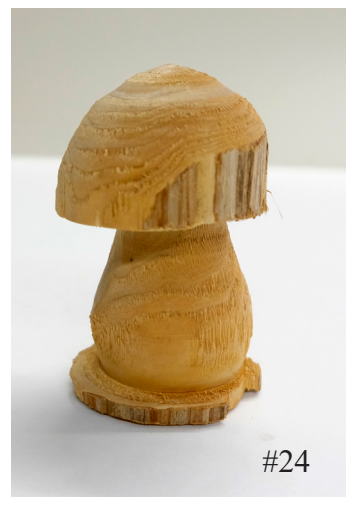
Mushroom (rough-cut) cedar height 4" $4.