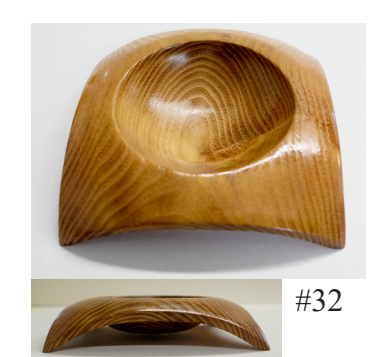
white oak, 6" x 6" 11/2" tall $35.