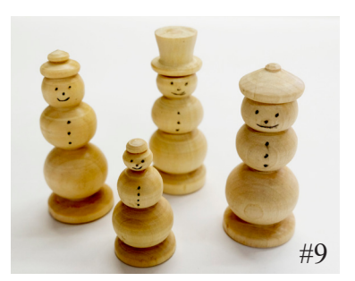
Snowmen Group B $15.

Snowmen in sets maple heights 31/4" to 41/2"