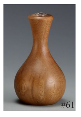
Bud vase walnut 3^{3}/_{8} " tall $25.