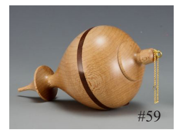
Christmas tree ornament maple with walnut height 5" $30.