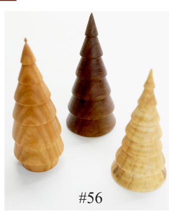
Set B Different kinds of wood $20.