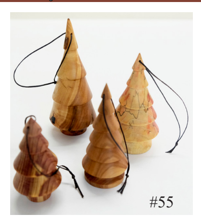
Set A Tree ornaments