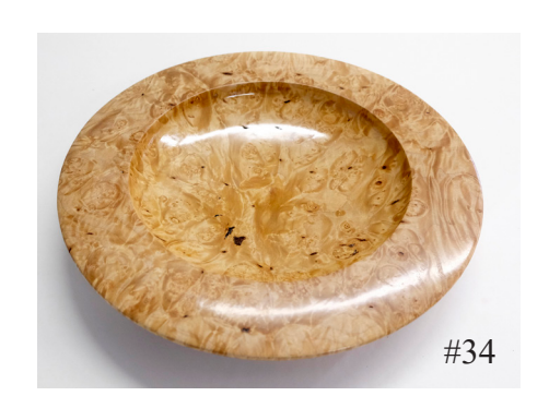
maple burl, top diameter 13" base diameter 43/4" $75. height 17/8"