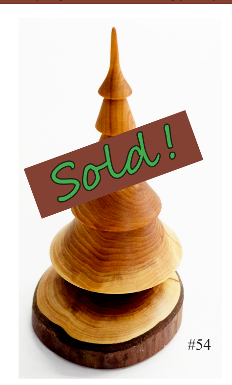
yew height 5" $20.