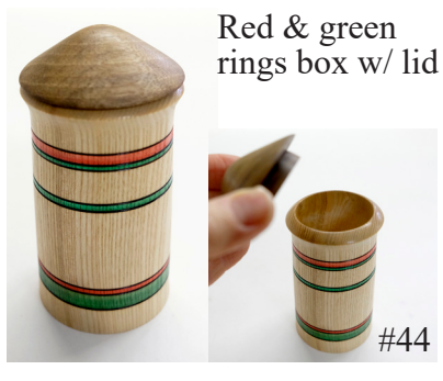
oak lid, ash body 4½" tall $29.