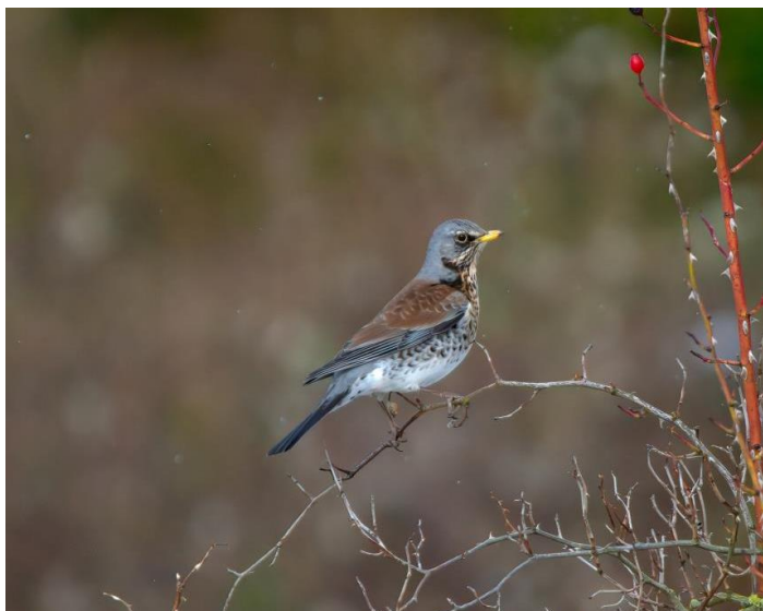
Fieldfare at Holy Well (Elliot Ranford)