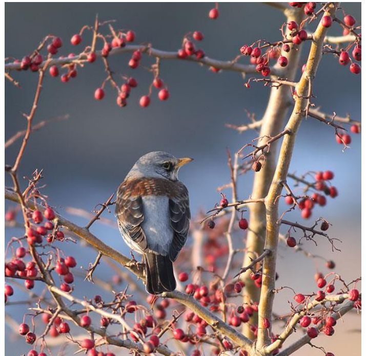
Fieldfare at Botolph's Bridge (Brian Harper)