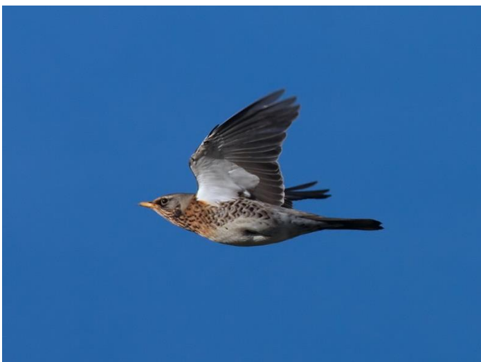
Fieldfare at Botolph's Bridge (Brian Harper)