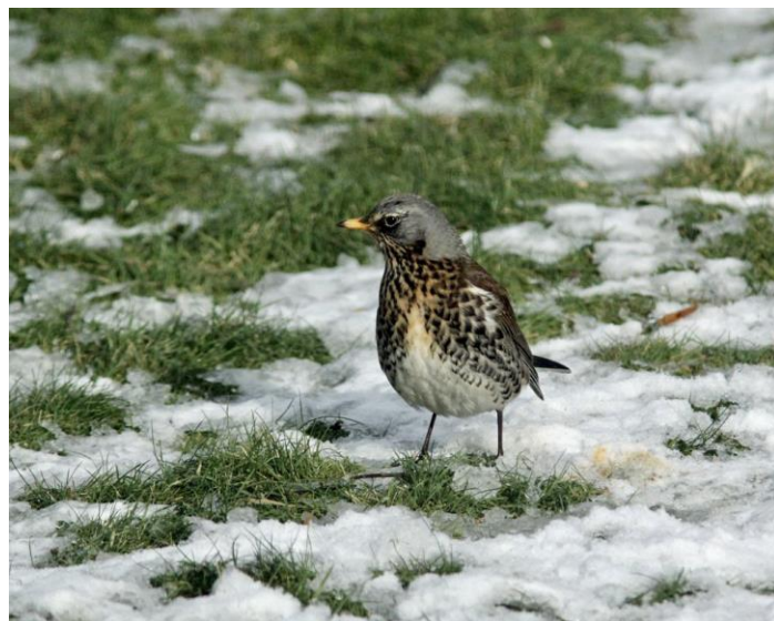
Fieldfare at Sellindge (Derek Smith)

Winter counts of 200 or more have been noted as follows: