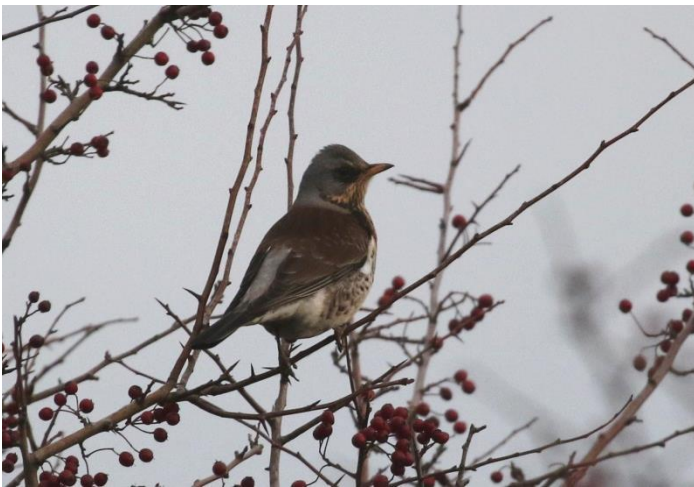
Fieldfare at Abbotscliffe

c.60 east at Nickolls Quarry on the 21 st March 1958 125 at Hythe Ranges on the 18 th April 1958 100 north at Hythe on the 7 th April 1964 100 at Abbotscliffe on the 23 rd March 1996 50 at Abbotscliffe on the 19 th March 2005 53 at Botolph's Bridge on the 19 th March 2018 76 at Beachborough Park on the 21 st March 2018