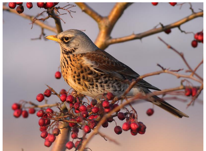
Fieldfare at Botolph's Bridge (Brian Harper)