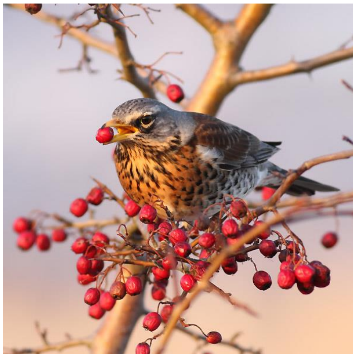
Fieldfare at Botolph's Bridge (Brian Harper)

In Kent is a common passage and winter visitor that is occasionally recorded in summer.