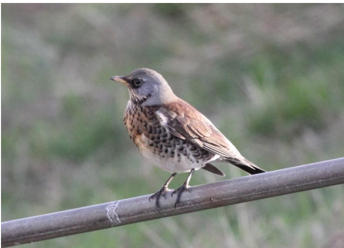
Fieldfare at Samphire Hoe (Ian Roberts)

The mean departure date over the most recent decade has been the 20 th April, with birds occasionally lingering into the last week of the month, when there have been singles at Capel Battery on the 24 th April 2000 and at Lympe on the 24 th April 2021, six at Church Hougham on the 26 th April 1995 and one at Capel Battery on the 27 th April 1997. May sightings have been noted in just four years: one at Abbotscliffe on the 1 st May 2017, one at Capel Battery on the 2 nd May 1997, one in off the sea at Abbotscliffe on the 3 rd May 2012 and one at Church Hougham from the 13 th to 19 th 1996. In 2016 there was an exceptional record of one seen by Dylan Wrathall at Seabrook on the 3 rd June, with presumably the same individual noted there by Paul Howe on the 5 th June.