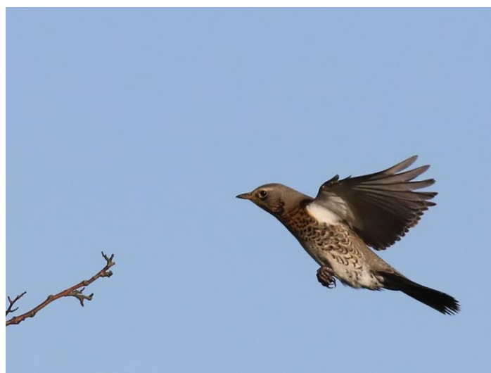
Fieldfare at Donkey Street