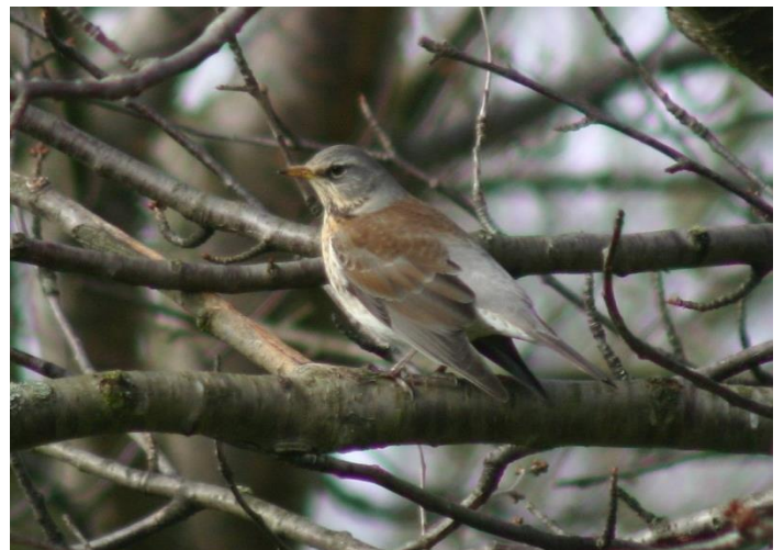
Fieldfare at Broadmead Village (Ian Roberts)