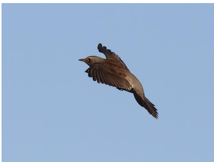
Fieldfare at Donkey Street (Brian Harper)

261 in off the sea at Abbotscliffe on the 16 th Oct 1994 200 in off the sea at Capel Battery on the 10 th Nov 1999 530 in off the sea at Capel-le-Ferne Café on the 20 th October 2003 263 west at Abbotscliffe on the 1 st November 2006 280 in off the sea at Capel Battery on the 19 th October 2015 785 in/west at Abbotscliffe and 900 in off the sea at Creteway Down on the 24 th October 2016 240 at Beachborough Park on the 24 th October 2018 1,200 east at Botolph's Bridge on the 26 th November 2018