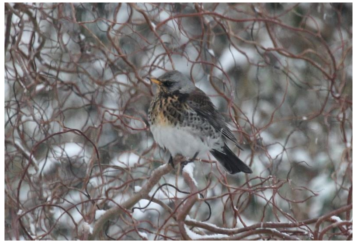
Cheriton (Dave Clarke)

The mean departure date over the most recent decade has been the 20 th April, with birds occasionally lingering into the last week of the month, when there have been singles at Capel Battery on the 24 th April 2000 and at Lympe on the 24 th April 2021, six at Church Hougham on the 26 th April 1995 and one at Capel Battery on the 27 th April 1997. May sightings have been noted in just four years: one at Abbotscliffe on the 1 st May 2017, one at Capel Battery on the 2 nd May 1997, one in off the sea at Abbotscliffe on the 3 rd May 2012 and one at Church Hougham from the 13 th to 19 th 1996. In 2016 there was an exceptional record of one seen by Dylan Wrathall at Seabrook on the 3 rd June, with presumably the same individual noted there by Paul Howe on the 5 th June.