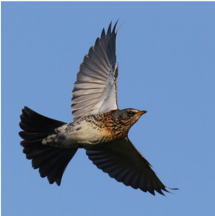
Fieldfare at Donkey Street