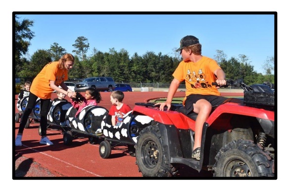
Student volunteers prepare children for the Train Ride. The many hard-working volunteers are critical for this event's success.