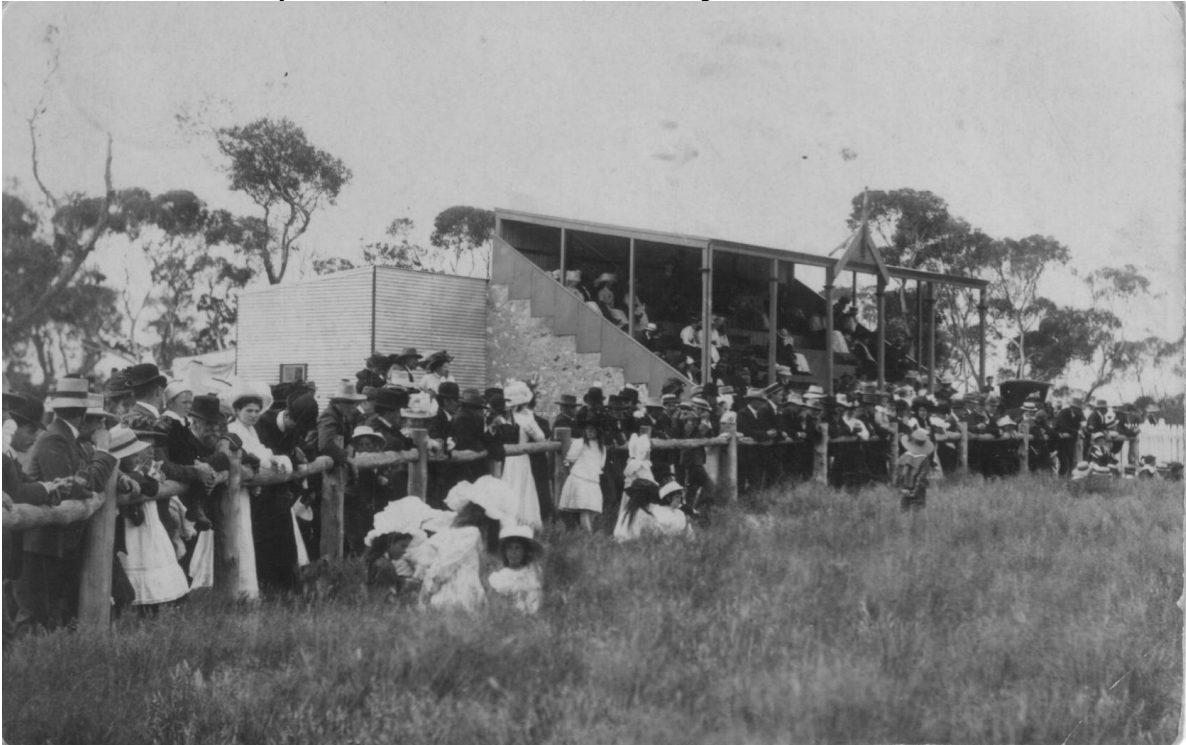
Mannum Show Committee 1908.

Early 1900s. The GRAND STAND existed, where a triangular block of trees are in 2019.