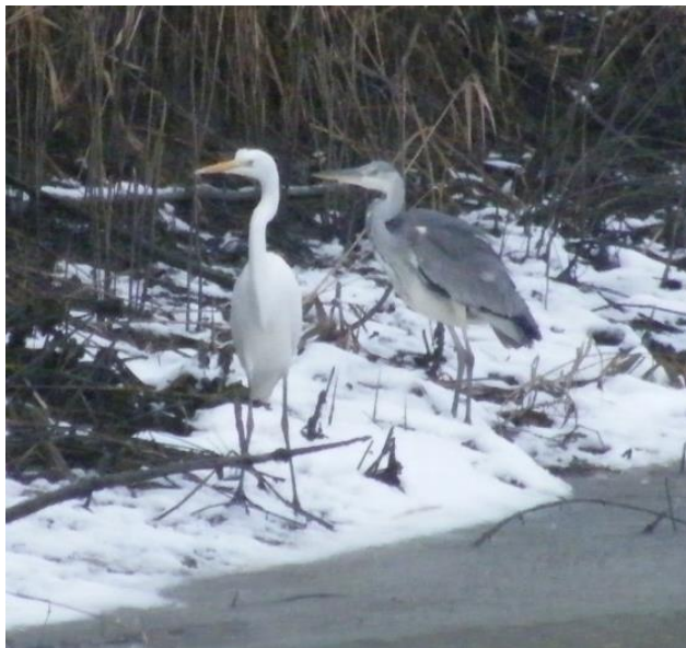
Great White Egret with Grey Heron at West Hythe

The record was accepted by KOS rarities committee.