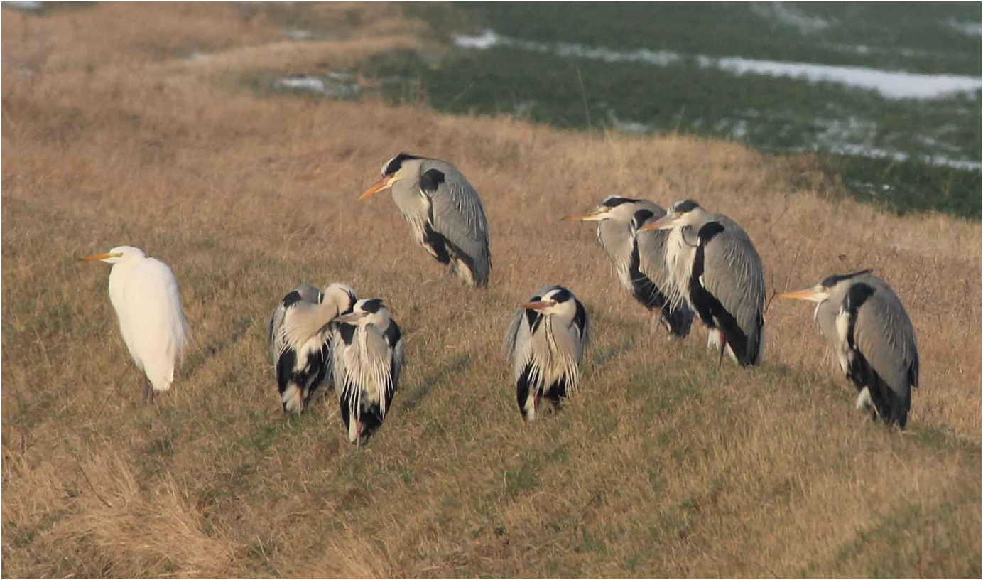
Great White Egret with Grey Herons at West Hythe (Ian Roberts)