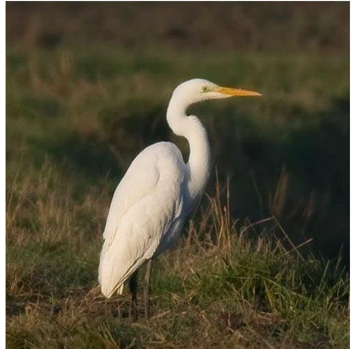
Great White Egret at Botolph's Bridge

In Kent it was a former vagrant, and is now a regular annual visitor, predominately during the winter months. There had only been nine records in the county before 2002 (KOS, 2020) but it has occurred annually since and by 2017 up to 20 could be seen at Dungeness during the autumn.