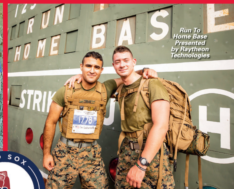
Run To Home Base Presented by Raytheon Technologies