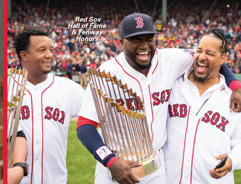
Red Sox Hall of Fame & Fenway Honors