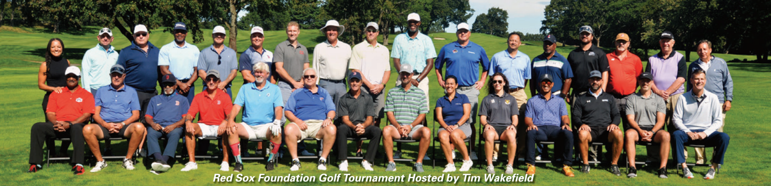
Red Sox Foundation Golf Tournament Hosted by Tim Wakefield