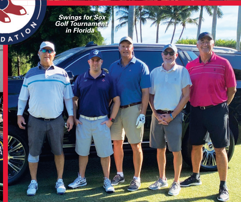
Swings for Sox Golf Tournament in Florida