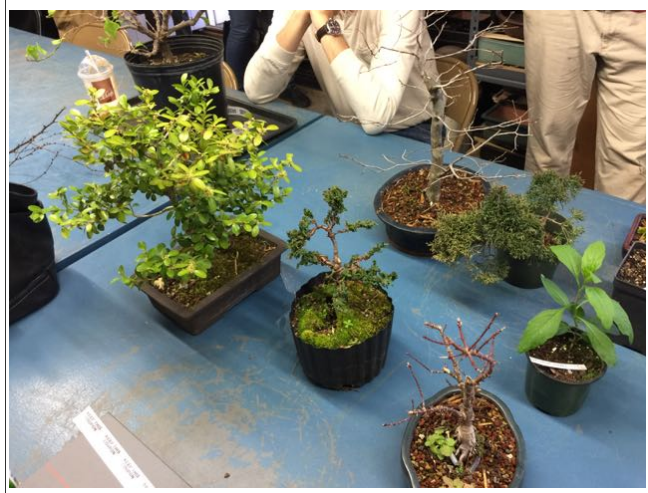
A small sample of the Raffle items available in February!