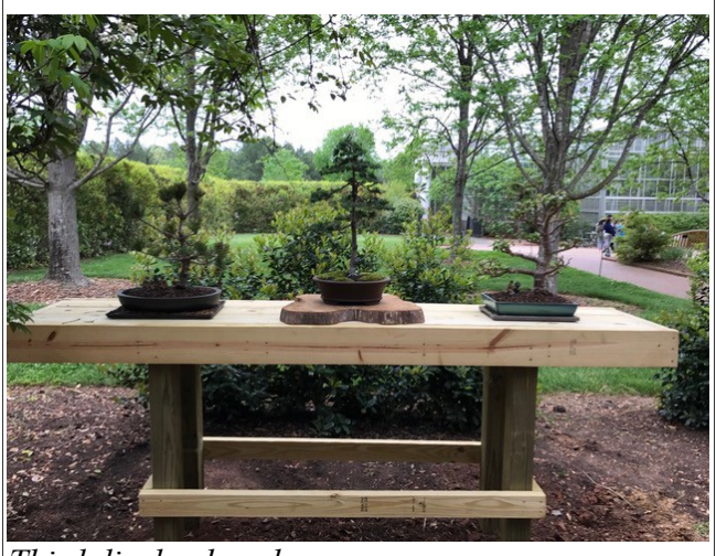
Third display bench.