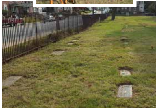
Bank of America volunteers trimmed flat grave markers in Section N and cleared vines from the Washington Street fence. We appreciate their labor in the spring and fall, and are grateful for the donation of new tools.