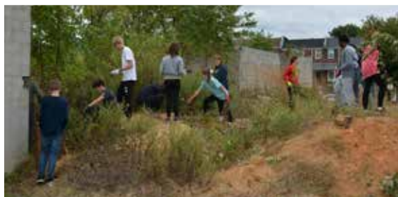
Wilmington Friends School students and faculty did a wonderful job removing small trees and tall weeds on the SE side of the cemetery. Thank you for your 9th year with us!