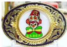
Gift Ideas Contact your President, Secretary or Editor for availability