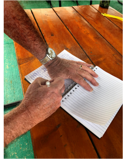
It is necessary to sign in and out with name and time