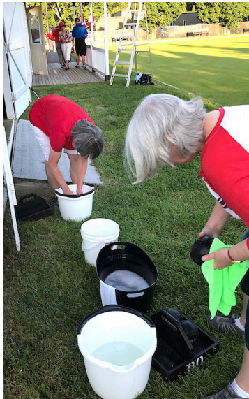
It is important to wash and sanitize club bowls after every use