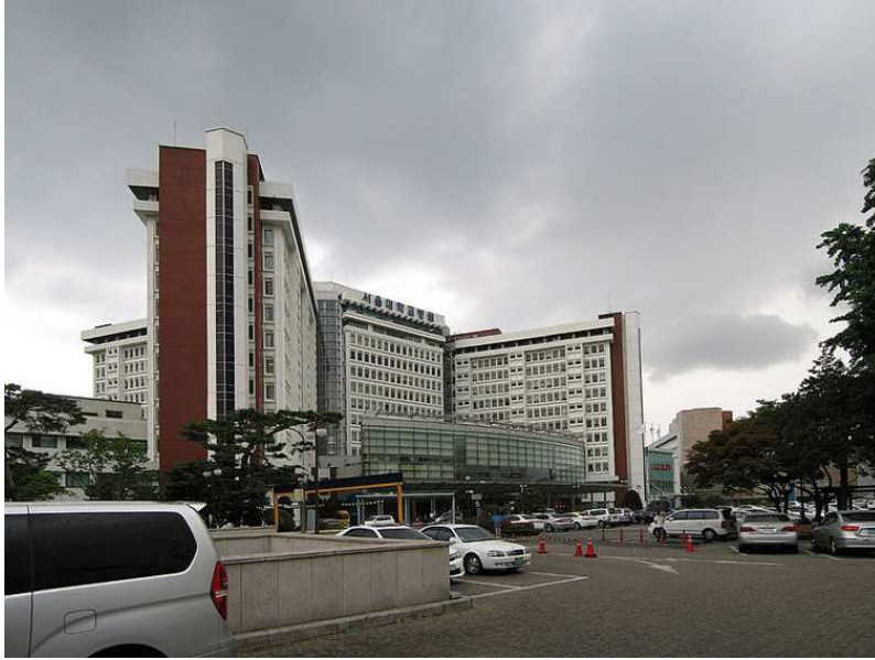
The Samsung Medical Centre