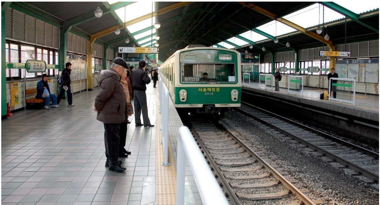
Subway Station on Line 3