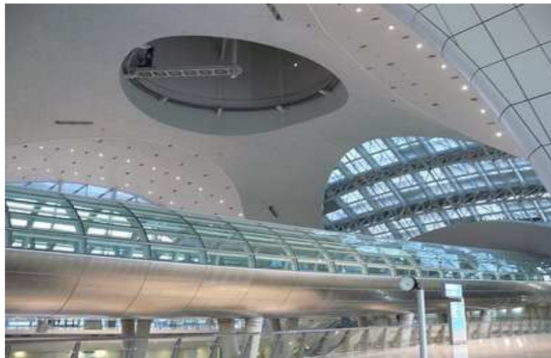
Incheon Airport – your final destination