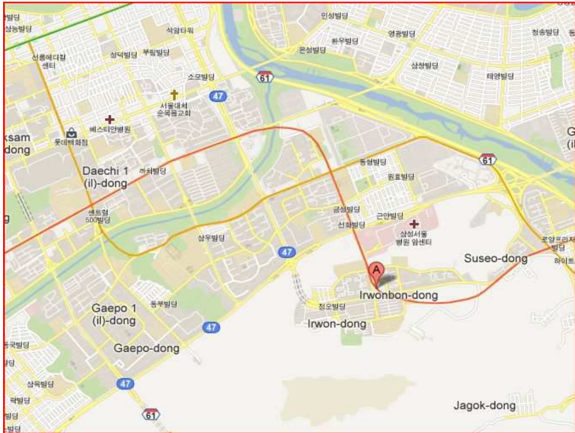
A = Irwon Station on Line 3 of the subway system