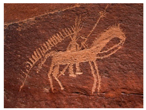
Ute rock art in 9-mile canyon.