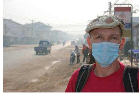
Smog in a village in northern Laos (tourist photo)

The unsustainable forest use is mainly caused by companies from Vietnam. Forests are cleared in Laos and shipped to Vietnam for the construction of furniture, from where these products are then exported with the label "Made in Vietnam". It is difficult for consumers to trace the true origin of the wood.