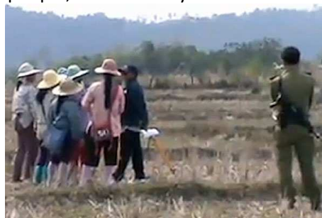
Protest of farmers against the robbery (Bokeo2014)

http://www.rfa.org/english/news/laos/rosewood-01102018160410.html