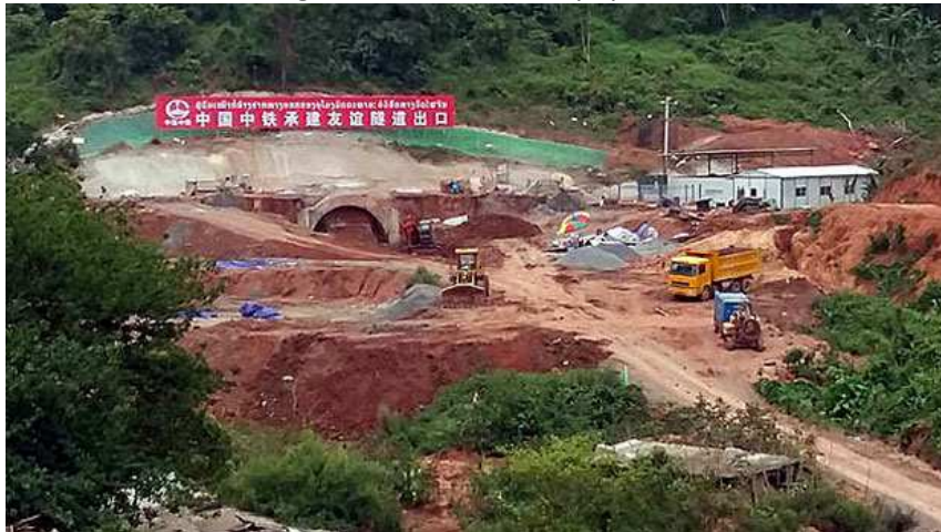
Railroad construction site in Luang Namtha province (Northern Laos), 12th July 2017.

With the construction of a high-speed train through Laos and the construction of special economic zones, China wants to expand its influence in the region. All of these projects are considered controversial and bring little benefit to the population in Laos