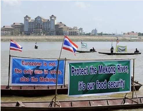
Protest against dams in Laos

https://en.actualitix.com/country/lao/laos-access-to-electricity.php