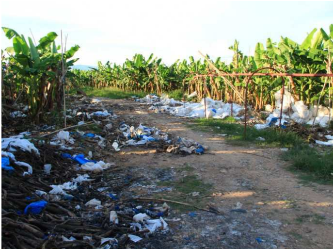
Polluted environment: When growing bananas, a huge amount of plastic waste accumulates.

Pointless large-scale projects such as the construction of a high-speed train which no one can use, by Chinese investors or by the expansion of monocultures in connection with the uninhibited use of pesticides, aggravate the food supply of the population. In addition, there are also national robberies by foreign investors and corrupt officials and a lack of environmental protection in wastewater management and waste management.