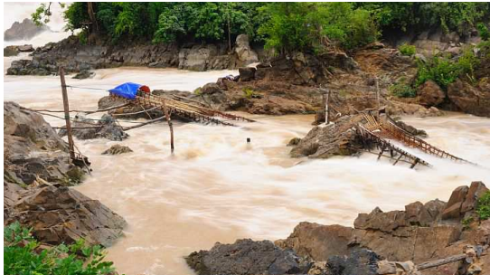
Bridge destroyed by monsum