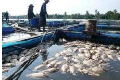
Fish dying on the Mekong

The sustainable use of drinking water is also in danger, due to a lack of sanitation and the uninhibited expansion of the dams. Another danger is the expansion of the monocultures in the country. In recent years, banana plantations, rubber plantations and other monocultures have increasingly supplanted the natural forest and have severely affected the ecosystems in the country.