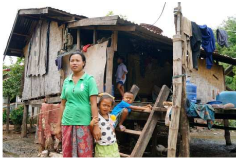
Farmer family in Phonethong near Vientiane