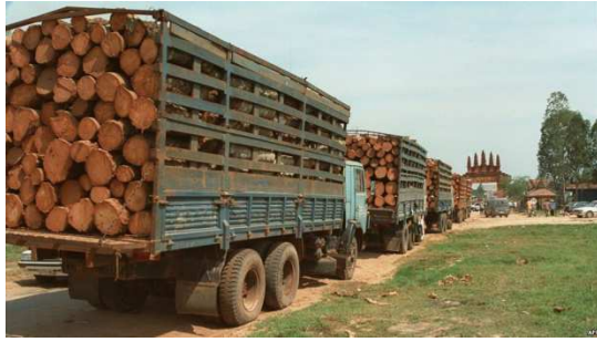
Truck column with wood from Laos at the border