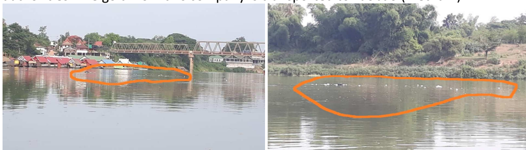
Fish kills in the Nam Ngum River

On May 11, 2018, residents of Thangone District, Xaythany Province reported that Vietnam's garbage disposal factories were dumping wastewater into the Nam Ngum River, resulting in fish mortality. But when the authorities came to see this, the population was forbidden to publish it. The company concerned operates gold mines, among others, which are declared as development projects. The proceeds and profits are not taxed, but compensation is paid to private individuals who work for the authorities. The gold from this company is transported to Laobao (Vietnam).