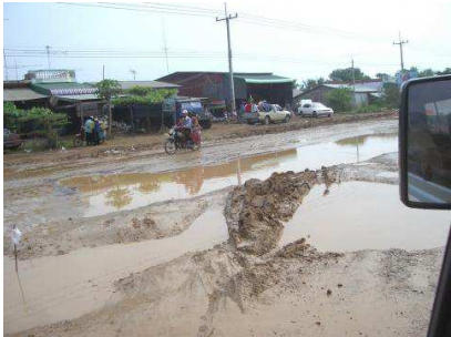
Main street in Phakse (2017)

Nevertheless, the construction projects are slow to progress and often money and building material disappear on the previously unexplained cause. How the Alliance for Democracy in Laos was reported by locals and was used with homemade cell phone videos and photos, still the most important transport links in the rain in the mud. The crews usually work very slowly, as they are often not paid by the government. Some construction companies already had to register for bankruptcy because the monies that were destined for them had disappeared into corrupt channels.