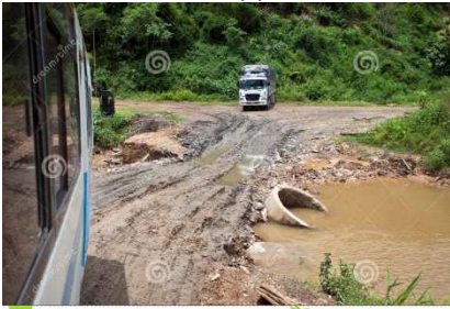
Provincial street in Laos (2012)

Pointless large-scale projects such as the construction of a high-speed train which no one can use, by Chinese investors or by the expansion of monocultures in connection with the uninhibited use of pesticides, aggravate the food supply of the population. In addition, there are also national robberies by foreign investors and corrupt officials and a lack of environmental protection in wastewater management and waste management.