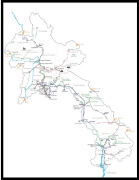
Map with the dams in Laos

Development workers and independent NGOs expect at least 30%. This is all the more surprising given that Laos claims to produce 1.9 GWh with its hydroelectric power plants.