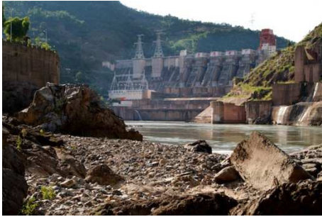
Dam on the Mekong