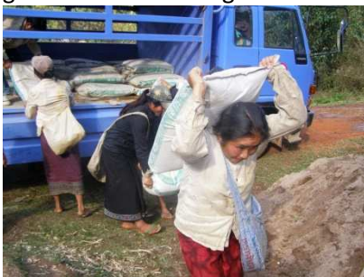
Distribution of food in the countryside

Issue: Laos is in the Least Developed Countries group: about 75 percent of its residents live on less than $ 2 a day, more than 25 percent on less than $ 1. Each resident accounts for approximately US $ 65 in foreign aid per year; a peak in international development cooperation. This has hardly affected the standard of living of its population. Widespread poverty is also blatantly opposed to the country's resource wealth, which includes coveted minerals and precious metals such as minerals. Copper features. Although much of its immense reserves of hydroelectric power is still unused, Laos already supplies large parts of Thailand with electricity. With an annual economic growth of eight percent, Laos is outbid only by China; while, for example, neighboring Vietnam, already traded as a new Asian tiger, did not even reach six percent last year. How is this contradiction between high economic growth and low living standards explained?