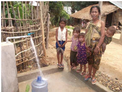
Public fountain in Huephen north of Luang Prabang

Issue: The Lao-PDR has the most water resources in every Asian country per capita, but much of it is uncertain. Drinking water can be contaminated with harmful chemicals and human waste and cause a variety of health problems. UNICEF is working in Laos to ensure that children and families in homes and schools have access to clean water and sanitary facilities.