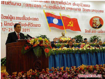
Communist Party Congress from Laos and Vietnam (2011)

Issue: Laos has taken two correct steps in the right direction with its entry into the ASEAN Alliance and its accession to the WTO. Likewise, the liberalization of the economy since 1987 has been an important milestone for a more sustainable development. However, corruption and lack of implementation of international standards and also its own laws inhibit the development in the country massively.