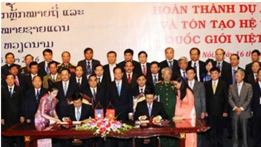
New border agreement between Laos and Vietnam (2016)

Laos has been able to compete in international competition, relying heavily on the help of Vietnam and China. This has led to an ever-increasing dependence. International observers see that the People's Republic of Laos is politically managed by Vietnam and economically by China. Our observers even go so far as to make the locals feel no longer to be lord in their own country. However, a major obstacle to such a partnership is the Vietnamese-Lao Friendship Treaty of 18.07.1977. This secures Vietnam's control over Laos and prevents other states from coming to a better and more intensive partnership. Without the consent of Hanoi, the government of Laos can not act here.