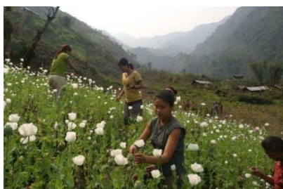
Opium Cultivation in North Laos (Akha)

http://www.worldpolicy.org/blog/2011/10/11/us-funded-rehab-center-abuses-lao-drug-users