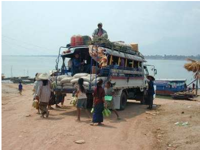
Bus traffic in Laos

During the monsoon season, when the rain falls from May to October, these paths become impassable. Vehicles are no longer coming up the mountains, slipping down the steep slopes, or sticking up to the axles in the mud. The remaining trucks sometimes block the road for days until they are excavated with a hoe and shovel and the sun has dried the lane. Fords are rushing to torrents after a heavy rain and can no longer be crossed; the floods are also tipping over a bus. During the rainy season, for almost half a year, farmers have difficulty getting to the next market or administrative center. The economy is almost paralyzed. Children often cannot go to school; Women who would rather release in the hospital must give birth to their child at home. and take the risk of losing your life or that of your child.