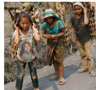
Child poverty in Laos

The "Lao Revolutionary People's Party" sees itself as a Marxist-Leninist party, which - according to the constitution - has an absolute leadership monopoly. In fact, only in easily accessible areas is it able to exercise this claim to leadership. In many of the remote regions, political loyalties are characterized by ethnic or clan structures. The political system is barely able to develop a binding force because it does little: Public goods such as health care, education and training, secured land use rights and efficient administration are only inadequately provided. Patronage networks play a much greater role than the formal organizational structures of a Leninist party. Laos is ranked 135th out of a total of 178 countries in the Transparency International Corruption Index. (Source: Stiftung Wissenschaft und Politik, Gerhard Will)