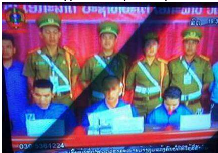
Imprisoned bloggers on Laotian television (04.06.2016)

Issue: Laos has the problem that many laws are not put into action. Often, laws adopted by the National Parliament are simply not implemented by the regional governments. Furthermore, many laws are bypassed by corrupt officials on a grand scale.