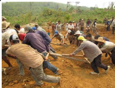
Agricultural work without machinery