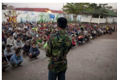
Re-education camp for drug addicts in Vientiane