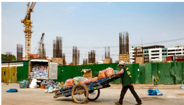
Urban development in Vientiane

Issue: The lack of infrastructure and the misplanning still hinders many communities in Laos. As described in SDG 9, only 1,700 km from 13,000 km of road are paved. Urbanization is an emerging issue in Laos. Urban areas are experiencing higher population growth rates than in the national average. Urban areas also have a number of problems, such as migrant workers, child protection, HIV, malnutrition of children among urban families, diseases, pollution and poor sanitary conditions. The proportion of urban population in Laos is expected to rise more than a third of the total population over the next few years. This is still below the global average of 54 percent. The urban population growth rate was 4.5 percent in the period 2005-2015. Obviously, most migratory flows go from city to town, mainly to the capital Vientiane.