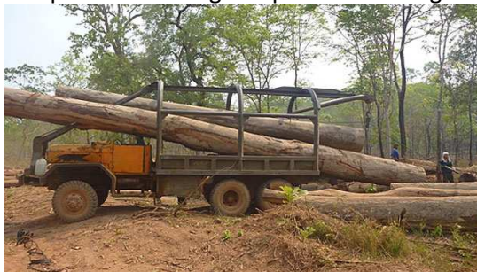
Deforestation in southern Laos

Almost daily, the Alliance for Democracy in Laos receives reports from locals about the growing influence of Vietnam in Laos. Massive deforestation and robbery are still coming. This is confirmed by international intelligence agencies and journalists. Another fact is the ongoing land grabs in Laos by foreign investors and Lao authorities. Many people have been relocated without a adequate compensation. We got reports from indigenous people, confirmed by international reporters.