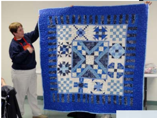
Molly's mentioned that Pat Speth has a block of the month online for 2015— http://www.freequiltpatterns.info/2015-vacation-time-mystery-bom.htm