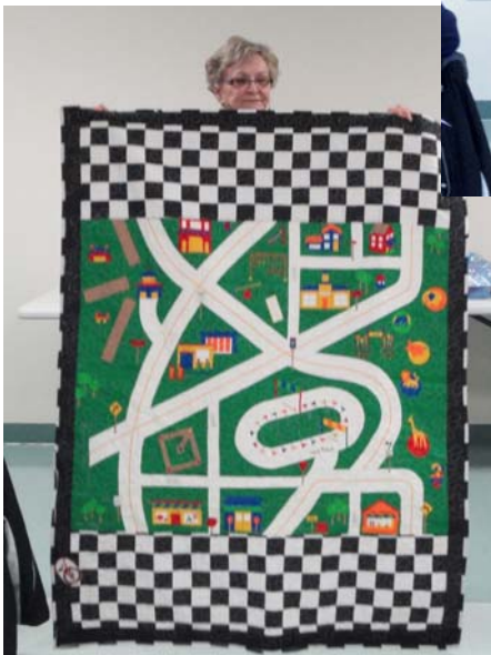
Bev showed a great kid quilt— notice the binding!