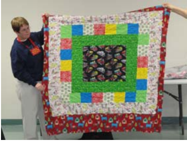
Molly had a busy month.