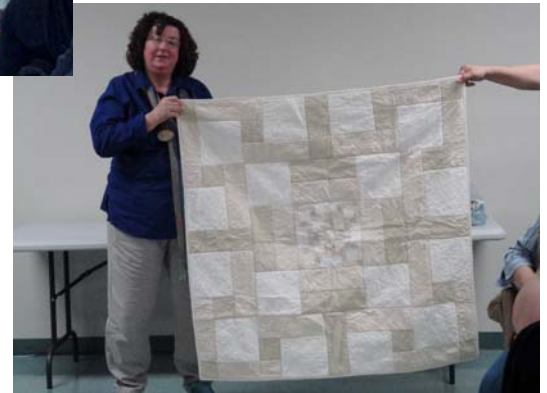
Mary drew inspiration from a DIY show about a tiled patio.