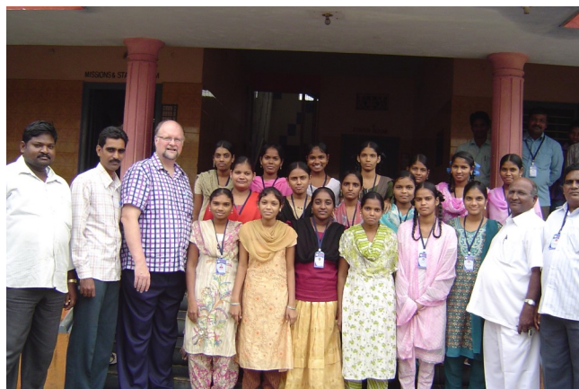
MTS Professors, Female Students & me

your bodies as a living sacrifice, holy and pleasing to God - this is your spiritual act of worship. Do not conform any longer to the pattern of this world, but be transformed by the renewing of your mind. Then you will be able to test and prove