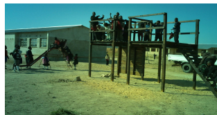
Play grounds always busy in use by the children

The orphans are now sliding on new chishesheleka (slide) at SOSH. There has been a great extension of playground constructions in two schools, Kambobe and Handibar. Each of the two schools has a slide and a tower. The football and netball pitches are being cleared at Kambobe school so that goals posts that are already donated to the new school may be planted. Whilst the first school benefits the pitches, the latter has already benefited the swings. The slides and goal posts were donated by ZOA Geneva while the towers and swings were donated by ZOA Roma. The most interesting thing is that all play grounds are always full of children as long as there is day light. Bellow are some of the play ground pictures.