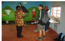
College Vice principal inspects finished canteen/laundry

What a wonderful work has been done on the walls of the canteen. As shown bellow, the canteen has been painted both outside and inside. It is now very beautiful and more clean for use.