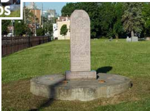
Circular Garden to be planted in September as part of the Sacred Grounds initiative.

The goal of the SACRED GROUNDS WILMINGTON program is to promote the installation of native plant gardens and wildlife habitats that connect people to nature and contribute to healthier, more resilient communities. Over the next two years, National Wildlife Federation (NWF), Delaware Interfaith Power & Light (DelIPL), Delaware Nature Society (DNS), and Delaware Center for Horticulture (DCH), will assist 20 congregations in Wilmington in becoming NWF designated Sacred Grounds sites. Riverview Cemetery has been invited to participate as a Sacred Ground site. The Orientation Workshop will take place in the Riverview Cemetery Visitor Center at the end of July.