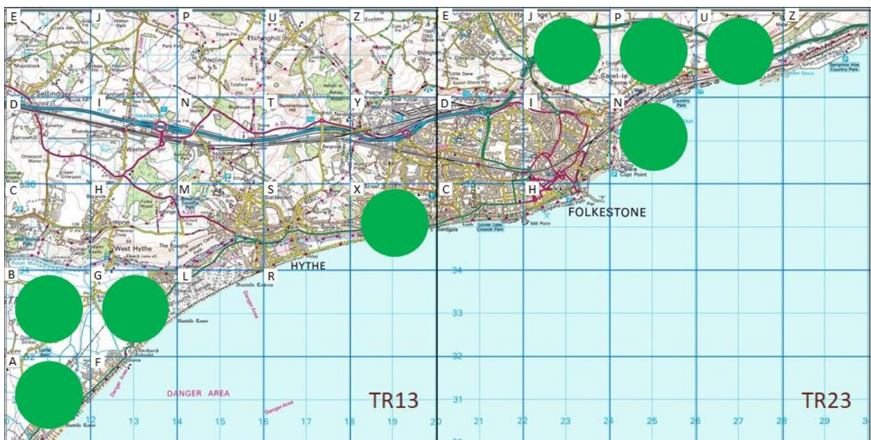
Figure 3: Distribution of all Ruff records at Folkestone and Hythe by tetrad

Figure 3 shows the distribution of records by tetrad. Most of the early records were from Nickolls Quarry but there have been no sightings there since 2003. The Willop Basin/Willop Sewage Works area has hosted nine of the 11 most recent records.