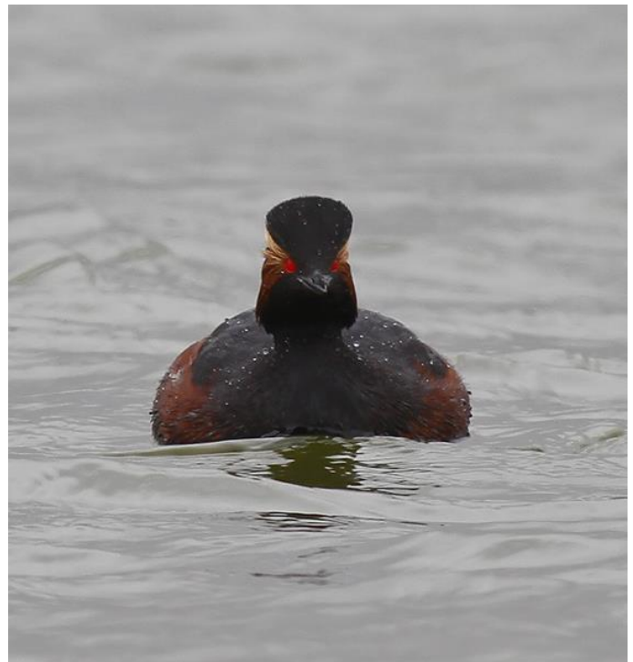
Black-necked Grebe at Nickolls Quarry