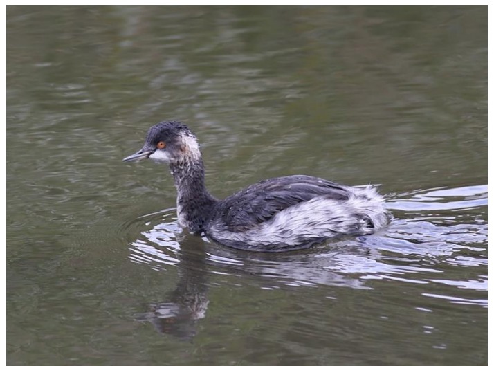
Black-necked Grebe on the Royal Military Canal at Seabrook (Brian Harper)