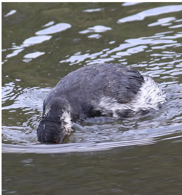
Black-necked Grebe on the Royal Military Canal at Seabrook (Brian Harper)