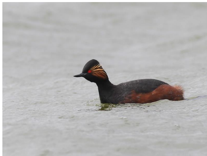
Black-necked Grebe at Nickolls Quarry (Brian Harper)