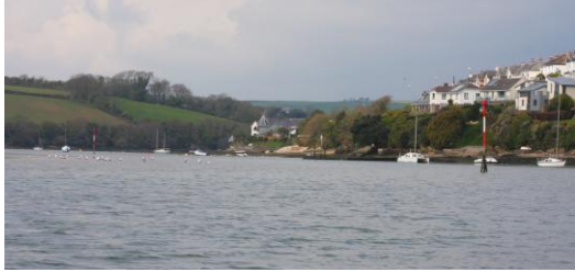
Kingsbridge Channel nearing Southville (Chart point 11)