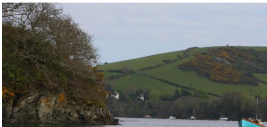
Scoble Point at the start of South Pool Creek (Chart point 4).

Heading East finds South Pool Creek entrance. The creek is a great place to explore in a dinghy on the tide for first timers. Scoble Point marks the Northern side of the Creek, initially deeper water lies to the South following the moorings.