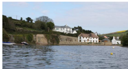
Visitor pontoon at South Pool (Chart point 5)

On reaching South Pool, the visitors pontoon to port is accessible two hours either side of high water. The award winning gastro pub, the Milbrook Inn is a short walk.