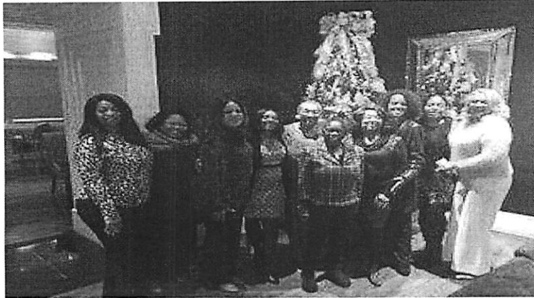
2018 Christmas Party, Gift Exchange & Meeting at Old Hickory at the Gaylord Hotel