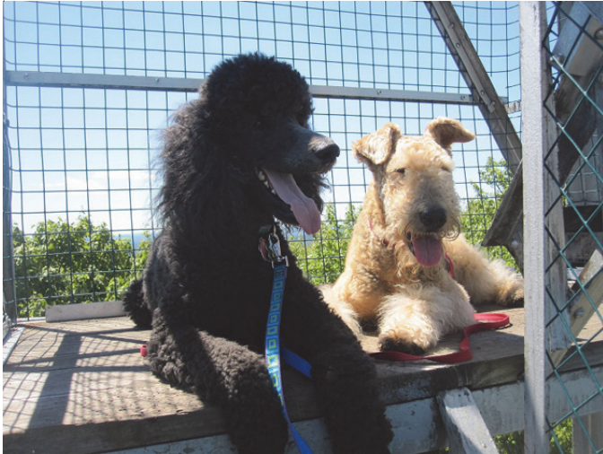
Willa and friend at the top of the Mt. Arab firetower.