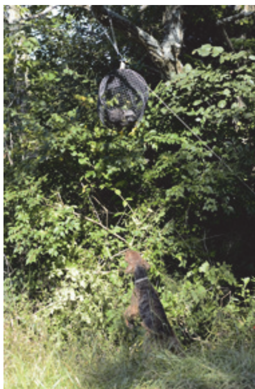
Mike tracked the raccoon and barked "treed!" to complete the third test.