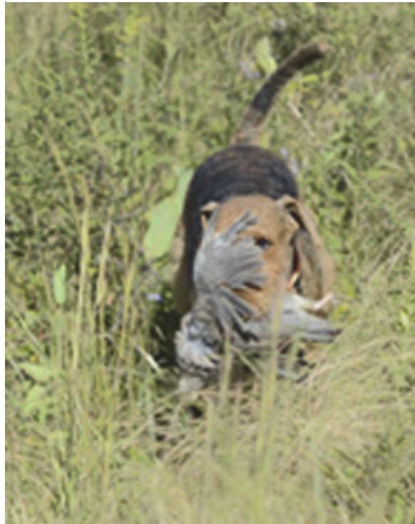
Chuckers don't always arrange themselves for a good line of sight back to the handler!