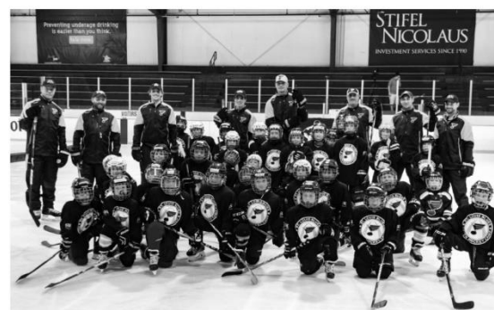
Photos from previous years of St. Louis Blues Youth Development Camps.