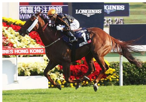
Able Friend winning the 2014 Hong Kong Mile.

Gold-Fun, who had finished second in the same event also in 2013. Able Friend beat Gold-Fun also in the Jockey Club Mile (G2) three weeks before the Hong Kong Mile. He is at his best over 1600 metres, but he has excellent form also over 2000 metres. His sire Shamardal became a dual classic winner when capturing the Poule d'Essai des Poulains (G1) over 1600 metres and Prix du Jockey Club (G1) over 2100 metres for Godolphin.