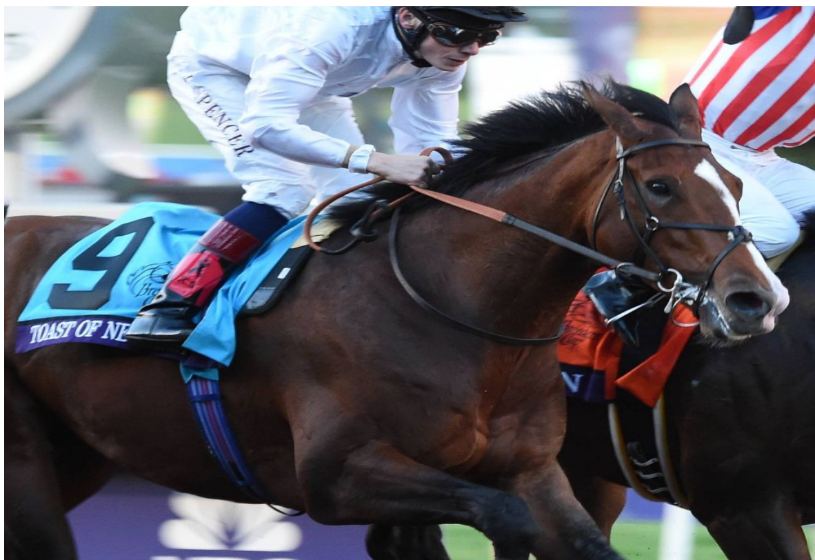
Toast Of New York