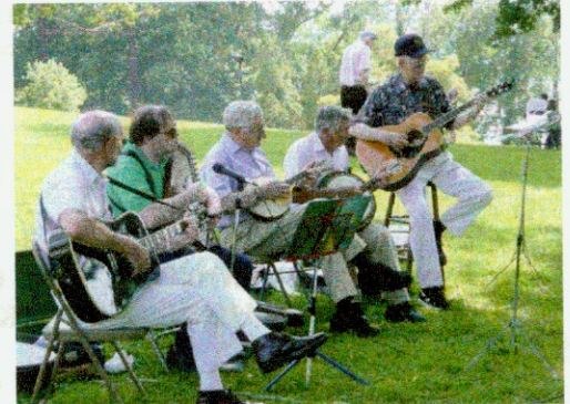
The Five Friends On The Front Lawn