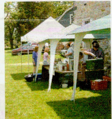
Our Milkshake Crew Hard at Work