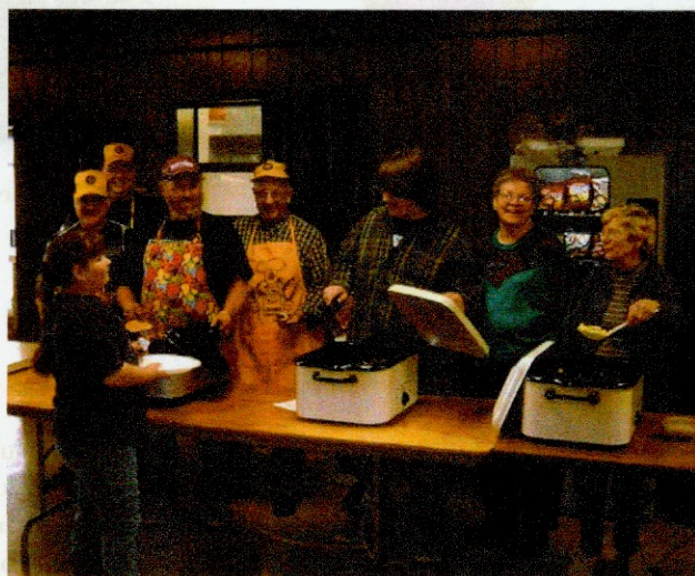
The HMPS members are assisting the Conoy Lions

ing those in the community in need and for helping causes that will benefit others. Through the years the Conoy Lions Club has been very supportive of the Haldeman Mansion Preservation Society. Once again, we greatly appreciate their support by the donation of the proceeds from