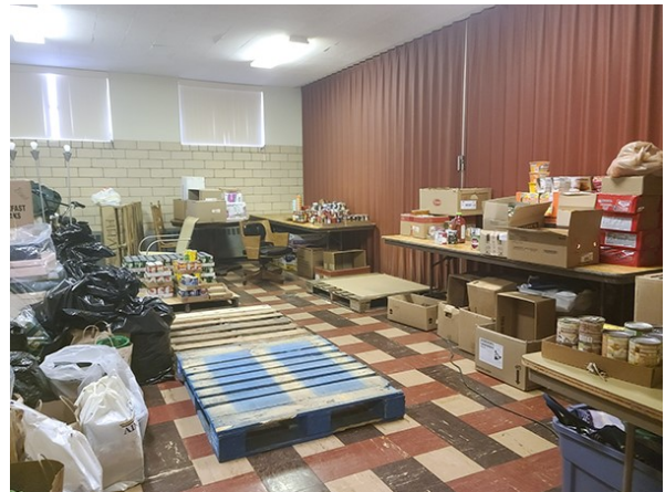
One of the rooms that store food for food pantry and storage for fall sale items.