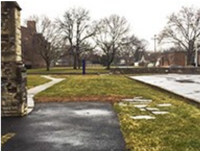
Notice the bushes have been removed. It gives a cleaner and more open view of the west side yard.

We had recently purchased sixteen new AirSoap purifier/sanitizers. They are an added measure of safety for everyone using this building. They are being placed in the most used portions of the church. They are portable and can be moved with consideration as needed. Here is some of the research I found in Google search: We're about to review the AirSoap, a powerful, innovative device that kills 99.99 percent of airborne viruses and bacteria. This is an impressive claim, equivalent to the performance you'll get from hospital-grade UV air cleaners. The AirSoap can treat up to 600 square feet of space. The AirSoap is exceptionally powerful, but it's very safe to use. It produces only 10 parts per billion of ozone. The beauty of the AirSoap is that it doesn't just eliminate particulates. It also kills bacteria and viruses. This is a significant benefit when compared to most HEPA filters. A HEPA filter will remove bacteria and some viruses, but it won't kill them.