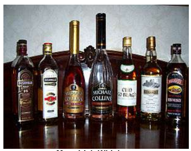
More Irish Whiskeys

Irish whiskey comes in several forms. Most Irish whiskey contains alcohol continuously distilled from a mixture of malted and unmalted barley and other grains. This mixed-grain whiskey is much lighter and more neutral in flavour than the type called single malt, and most such mixed-grain whiskey is blended with single malts to produce relatively light flavored blended whiskey. However, there are a few Irish whiskies made from 100% malted barley and distilled using pot stills. Such a whiskey, when produced by a single distillery, is called a single malt whiskey .