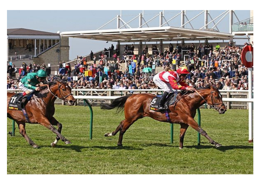
Magnus Maximus, backed at 50-1, winning with ease