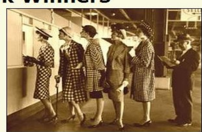
We do the research , you just join the queue and put your bet on.