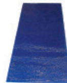
BD2110-25 Gel Overlay for Bean Bag (BD-BB3076) 72"L x 20"W x .25"H