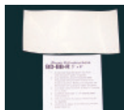
BD-BB-R Bean Bag/Gel Bean Bag Repair Patch 3" x 6" (Cut-to-size needed)