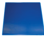
BD2140-25 Gel Overlay for Bean Bag (BD-BB2020) 20"L x 20"W x .25"H