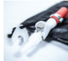
BD-BB176226 White Valve Replacement Kit w/Safety Clip