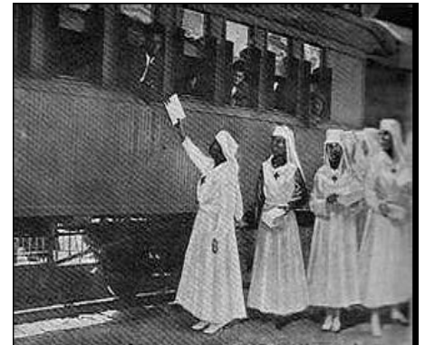
Black soldiers on troop train passing through New Orleans being served chocolates and cigarettes by the Colored Auxiliary of the American Red Cross (Scott, 1919)

spectacular. We arrived after Armistice was signed which alone was anticlimactic. So, we had no opportunity for “service above and beyond the call of duty.” But each one of us...did contribute quietly and with dignity to the idea that justice demands professional equity for all qualified nurses.”