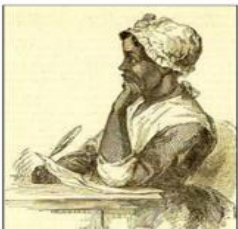
Phillis Wheatly Was a very literate Black woman, used her writing ability to praise and express appreciation for General George Washington during the Revolutionary War. He showed his appreciation by inviting her to visit him at his headquarters in February of 1776.