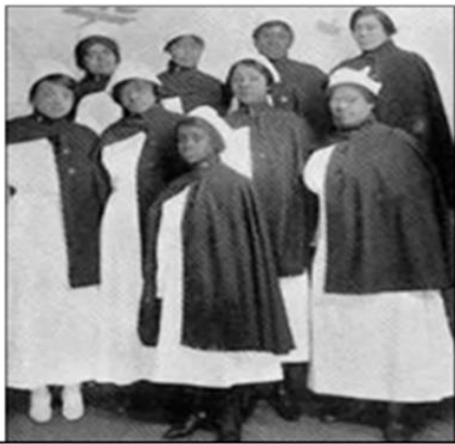
Group of Red Cross Nurses on duty as the Base Hospital Camp Grant, Illinois