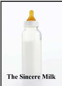
The Sincere Milk

" IF the Spirit of him that raised up Jesus from the dead dwell in you , he that raised up Christ from the dead shall also quicken your mortal bodies by his Spirit that dwelleth in you " (Romans 8:11).