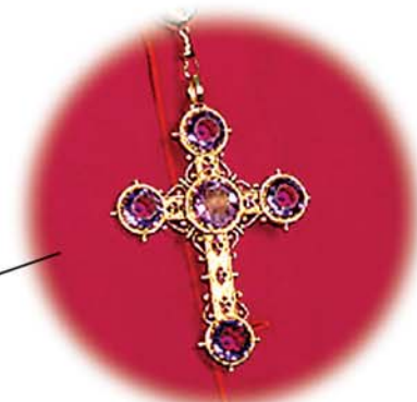
A close-up of Bishop Brandt's Pectoral Cross

Worn over the mozzetta when in choir dress. Most bishops have two, one for every day and a more elaborate ceremonial one on a green and gold cord. When the bishop is dressed in a suit, it is usually placed in the jacket pocket with the chain showing.