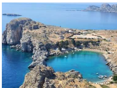
The view from the acropolis of Rhodes