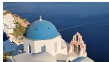
Santorini, one of the most beautiful places in the world