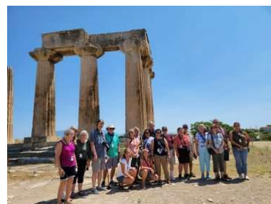
Corinth! You will "hear" Paul's preaching here!