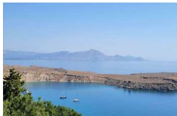
The view from Patmos at the cave where John wrote Revelation

If you're new to our email list, click here to read about Israel, Egypt & Jordan.