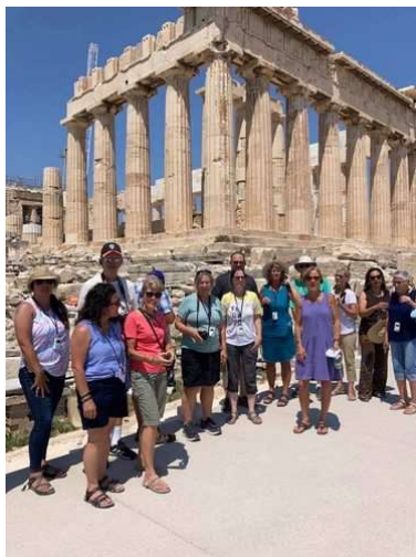
The Parthenon in Athens, a block from our hotel