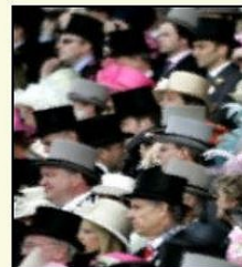
Royal Ascot - a tough meeting for punters, but selective betting has paid

Starting Bank: £100. Balance after 5 days: £1,155