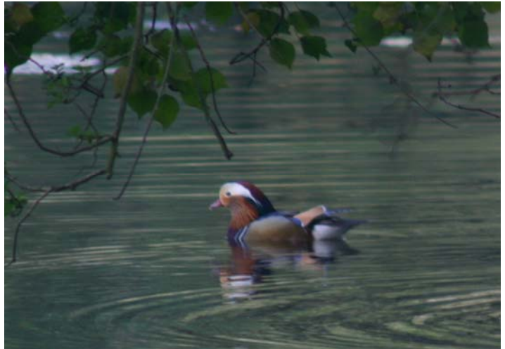
Mandarin at Brockhill CP (Ian Roberts)

The first Turtle Dove was at West Hythe the next day and a Greylag Goose, 3 Arctic Skuas, 35 Common Scoters, 47 Brent Geese, 162 Sandwich Terns and 200 'commic' Terns flew east past Folkestone Beach. The first two Hobbies were seen over Folkestone on the 26 th and a Yellow Wagtail and a Corn Bunting were at Church Hougham the next day.