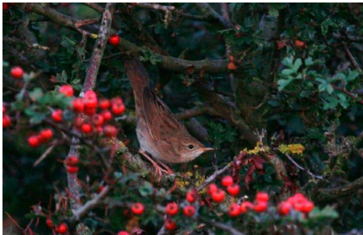
Grasshopper Warbler at Abbotscliffe (Dale Gibson)

A north-westerly on the 12 th produced a Pied Flycatcher, a Redstart, a Tree Pipit, a Yellow Wagtail, a Willow Warbler, 2 Reed Warblers, 2 Lesser Whitethroats and 8 Chiffchaffs at Samphire Hoe, a Redstart, 2 Spotted Flycatchers, 3 Buzzards, 8 Wheatears, 9 Yellow Wagtails and 15 Chiffchaffs at Capel-le-Ferne Gun Site, and a Lesser Whitethroat, 3 Whinchats and 5 Wheatears along Princes Parade, Hythe. A Lapland Bunting was found in the gully at Abbotscliffe on the 13 th (where it remained until the 18 th ) and a Redstart, 2 Wheatears, 2 Blackcaps, 2 Whitethroats, 3 Yellow Wagtails, 12 Chiffchaffs and around 100 Meadow Pipits were also seen, whilst 500 Swallows flew west.