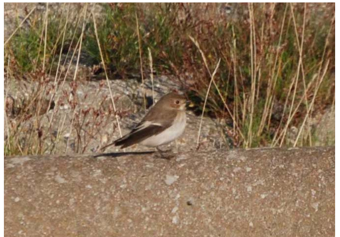
Brambling and Pied Flycatcher at Samphire Hoe