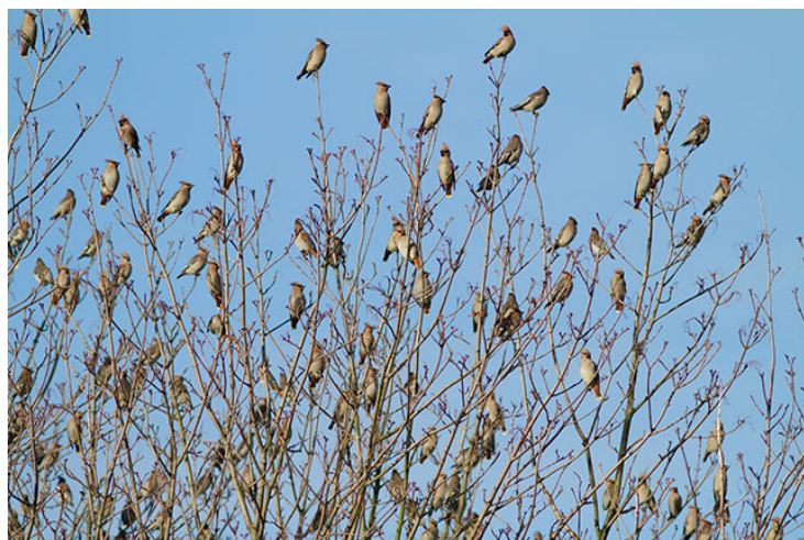
100 of the Waxwing flock at Park Farm