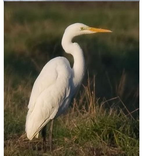
Great White Egret at West Hythe