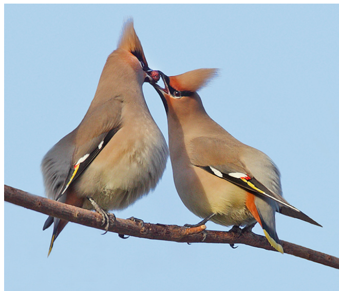
Waxwings at Park Farm (Steve Ashton)