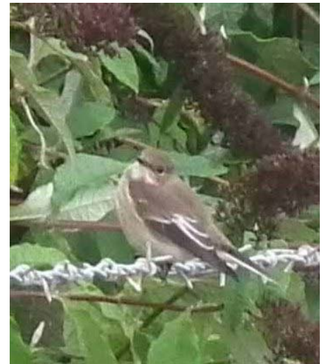
Pied Flycatcher at Samphire Hoe (Paul Holt)

A Spotted Redshank at Samphire Hoe on the 30 th was a new bird for the site and a Willow Warbler, 2 Swifts, 2 Black Redstarts, 3 Whitethroats, 4 Wheatears, 6 Robins and 150 House Martins were also noted. August ended with a Pied Flycatcher, a Little Egret, a Blackcap, a Chiffchaff, 2 Redstarts, 3 Whinchats, 4 Black Redstarts, 12 Wheatears and 38 Mediterranean Gulls at Samphire Hoe on the 31 st .