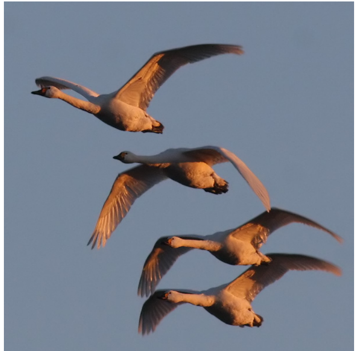
Bewick's Swans at Botolph's Bridge (Brian Harper)

On the 19 th there were 16 Tufted Ducks and 54 Pochard at Nickoll's Quarry and these increased to peaks of 53 of the former on the 24 th and 104 of the latter the following day. A female / immature Scaup was on the sea close inshore of Sandgate on the 19 th and up to 4 Goosanders were in the Botolph's Bridge area from the 18 th , with one at Nickoll's Quarry on the 30 th . Up to 2 Little Egrets frequented the Botolph's Bridge area from the 18 th and singles were at Nickoll's Quarry on 2 dates. A Marsh Harrier was at Botolph's Bridge on the 26 th and a Kestrel flying over Hythe town centre on the 19 th was an unusual record, whilst a Peregrine at Botolph's Bridge from the 25 th (records away from the cliffs are still relatively scarce). Single Water Rails were at Seabrook and Hythe Roughts and 107 Coot were counted at Nickoll's Quarry on the 25 th .