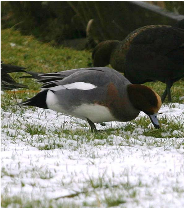
Wigeon at Nickoll's Quarry (Ian Roberts)

90 Wigeon were at Nickoll's Quarry on the 19 th , with 30 off Samphire Hoe on the 21 st , 80 along Donkey Street on the 22 nd , 85 at Nickoll's Quarry and 95 on the Canal Cutting on the 24 th , and 170 at the former site the next day. With even the larger lakes beginning to freeze, Wigeon began to congregate on the sea and an incredible 1,550 were counted off Hythe Redoubt on the 25 th , whilst this flock increased still further to a phenomenal 2,850 on the 27 th . Other dabbling duck included peaks of 34 Gadwall at Nickoll's Quarry on the 24 th and 15 on the Canal Cutting on the 27 th , a report of 100 Teal at Nickoll's Quarry on around the 22 nd , 12 Pintail there on the 26 th , and 6 Shoveler at Nickoll's Quarry on the 19 th , with 2 at Botolph's Bridge on the 26 th .