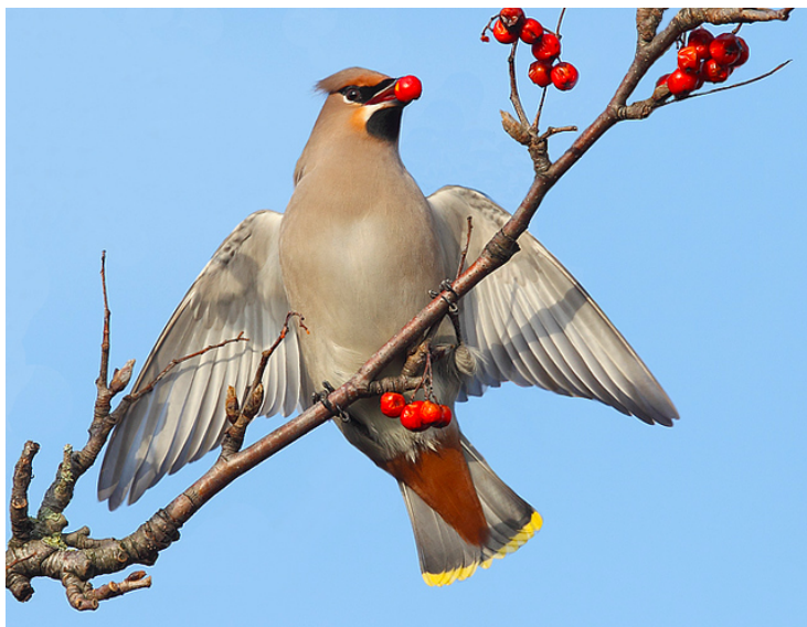
Waxwing at Park Farm (Steve Ashton)