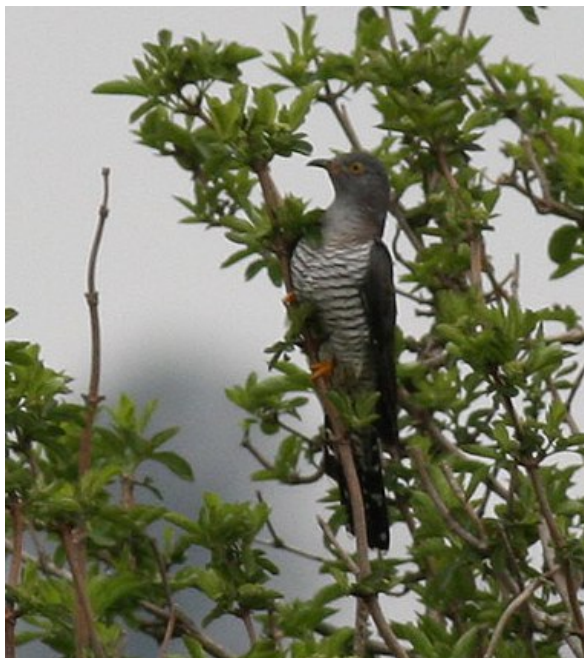
Cuckoo at Botolph's Bridge (Brian Harper)