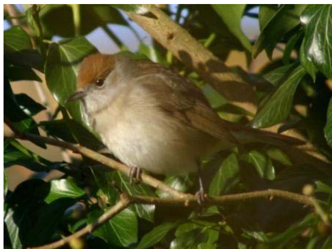
Blackcap in a garden in Hythe (Ian Roberts)

There was an increase in auks towards the end of the month, including 25 Guillemots off Mill Point on the 22 nd and 40 Razorbills off Hythe on the 26 th . There were only single records of Little Owl (at Nickoll's Quarry on the 18 th ) and Tawny Owl (at West Hythe on the 25 th ) in January. Kingfishers were seen at Botolph's Bridge, Hythe, Sandling and West Hythe.