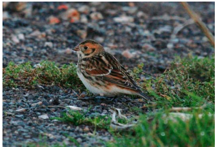
Lapland Bunting at Abbotscliffe (Dale Gibson)

Temperatures fell as the wind continued round to the north-west and the day-time maximum on the 17 th was just 16 Celsius, whilst at night it fell to 6 Celsius (compared to day-time highs of 21 and night-time lows of 16 earlier in the month). It remained generally dry but rather cloudy. Just 4 Yellow Wagtails and 60 Meadow Pipits were noted at Abbotscliffe on the 16 th , but the next day a Merlin, a Swift, a Spotted Flycatcher, 2 Great Spotted Woodpeckers, 2 Whinchats, 3 Whitethroat, 3 Blackcaps, 4 Wheatears, 10 Chiffchaffs and 200 Meadow Pipits were seen there, with another 100 Meadow Pipits at Capel-le-Ferne.