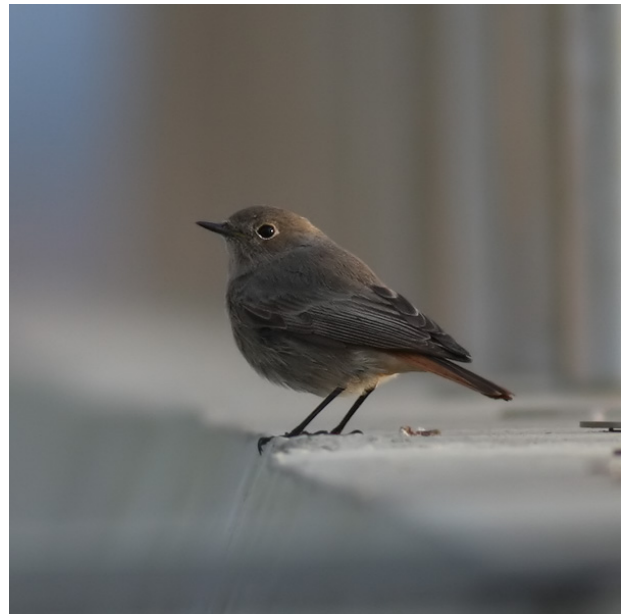
Black Redstart at Hythe Redoubt (Brian Harper)

Of the commoner ducks; 30 Common Scoter flew east past Samphire Hoe on the 20 th , 3 Teal flew east past Hythe on the 22 nd , 3 Shelduck flew east past Mill Point on the 24 th and a Pochard flew west past Hythe on the 27 th . Numbers increased from the 28 th , when 6 Gadwall, 14 Wigeon and 20 Teal were on the sea off the Hythe Redoubt and 35 Wigeon were seen off Hythe. On the 29 th 77 Wigeon were on the sea off Hythe and 85, possibly incorporating the same flock, flew east past Mill Point. 5 Gadwall, 6 Common Scoters and 7 Shelduck were seen off the Willop Outfall and 5 Brent Geese flew east at Hythe Redoubt. The last day of the month produced 6 Tufted Ducks, 6 Wigeon, 8 Shoveler and 8 Gadwall at Nickoll's Quarry, where Coot had increased to 22.