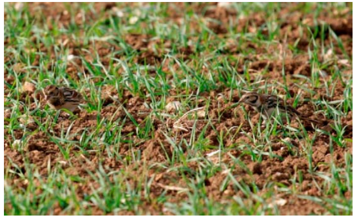
Lapland Buntings at Abbotscliffe (Dale Gibson)

The 17 th saw overnight temperatures dip to 7 Celsius but another 2 Lapland Buntings arrived in the gully field at Abbotscliffe and 2 Buzzards, 2 Wheatears, 4 Ring Ouzels, 4 Sparrowhawks, 6 Chiffchaffs, 14 Redwings, 30 Sand Martins, 600 House Martins and 800 Swallows were also seen, whilst 6 Yellowhammers, 9 Redpolls, 11 Reed Buntings, 57 Siskins and 1,080 Goldfinches (the peak count in a month during which over 4,750 were logged) flew east and 350 Starlings flew in off the sea. Two 2 Whinchats were at Crete Hill and a Great Spotted Woodpecker, 12 alba wagtails, 14 Sky Larks and 70 Meadow Pipits flew in off the sea there. A Grey Wagtail and 4 Chiffchaffs were noted at Hythe and a Great Spotted Woodpecker flew east there too.