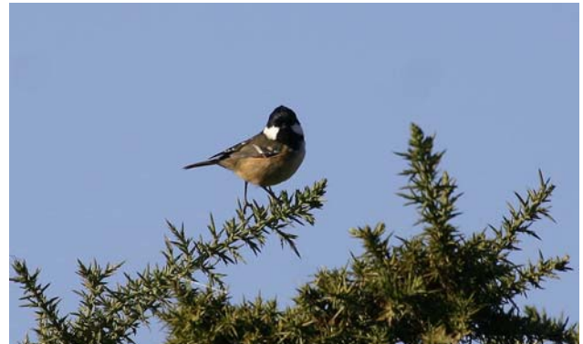
Continental Coal Tit at Abbotscliffe (Ian Roberts)

A switch back to a north-westerly breeze made for a good day on the 24 th , with a Wood Lark , a Shore Lark , 2 Snipe, 5 Reed Buntings, 6 Yellowhammers, 8 Lapland Buntings , 50 Linnets and 100 Sky Larks counted in a stubble field at the eastern end of Abbotscliffe. A Bearded Tit was seen briefly before it flew west and a Ring Ouzel, 2 Firecrests, 3 continental Coal Tits, 4 Song Thrushes and 14 Redwings were also in the bushes. Overhead a Great Spotted Woodpecker, 2 Waxwings , 2 Redwings, 2 Redpolls, 8 Fieldfares, 18 Sky Larks, 26 Linnets, 37 Chaffinches and 470 Starlings flew in off the sea, another Waxwing flew south, 2 Reed Buntings, 3 Rooks, 5 Bramblings, 11 Swallows, 11 House Martins and 19 Stock Doves went west, and 17 Goldfinches and 35 Siskins flew east. Elsewhere a Little Egret, a Cetti's Warbler, a Kingfisher and 3 Grey Wagtails were at Botolph's Bridge, a Teal, a Chiffchaff and 8 House Martins were at Copt Point and a Purple Sandpiper had returned to the shore by the Hotel Imperial, Hythe.