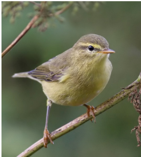
Willow Warbler at Botolph's Bridge (Brian Harper)

A cool north-westerly breeze brought the best arrival of the month on the 28 th , when a Grasshopper Warbler, a Redstart, a Swift, a Hobby, a Blackcap, a Lesser Whitethroat, a Spotted Flycatcher, 2 Pied Flycatchers, 10 Wheatears, 10 Willow Warblers, 15 Whinchats and 18 Whitethroats were at Abbotscliffe and a Pied Flycatcher, a Reed Warbler, a Sedge Warbler, a Common Sandpiper, 2 Redstarts, 2 Lesser Whitethroats, 3 Blackcaps, 3 Oystercatchers, 4 Whinchats, 8 Wheatears and 10 Whitethroats were at Samphire Hoe.