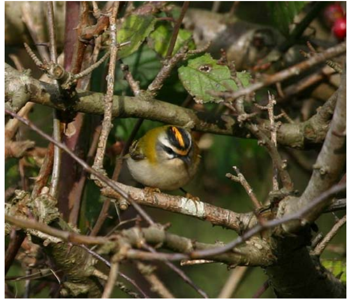
Firecrest at Church Hougham

The highlight of this latter period of November was a Great White Egret , presumably the bird from last winter returning, which frequented the Botolph's Bridge area from the 27 th . It was accompanied by a Little Egret, another of which was seen at Samphire Hoe.