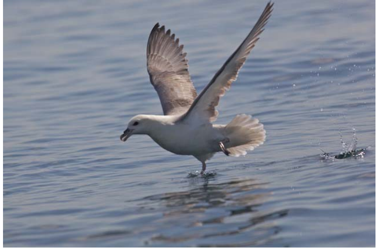
Fulmar off Folkestone (David Featherbe)

Two Common Sandpipers were at Samphire Hoe on the 21 st , when 30 Common Scoters were noted offshore. A Wood Warbler and 5 Willow Warblers were at Abbotscliffe on the 27 th , and 2 Cuckoos, 6 Willow Warblers and 13 Whitethroats were seen there the next day, with a Sedge Warbler present on the 29 th .