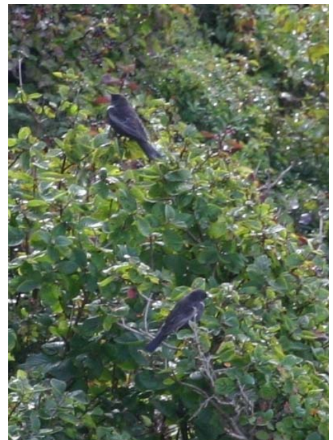
Ring Ouzels at Abbotscliffe