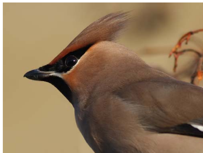
Waxwing at Hythe

Waders were still relocating after the early freeze and Dunlin were seen at Folkestone Harbour (2), Samphire Hoe (3) and Botolph's Bridge (7) on the 7 th . Jack Snipe were at Brockhill CP on the 6 th and at Nickoll's Quarry the next day, when 15 Snipe were also present. Snipe were also noted at Blackhouse Hill (4 on the 6 th ), Samphire Hoe (1 on the 7 th ) and Newington (4 on the 8 th ) and Woodcock were at Saltwood on the 6 th , Nickoll's Quarry on the 7 th and Samphire Hoe (2) on the 8 th . Two Green Sandpipers remained in the Botolph's Bridge area and 3 Redshank at Samphire Hoe on the 6 th were notable. A Black Redstart and 2 Stonechats were at Samphire Hoe on the 6 th , 65 Redwings were at Church Hougham on the 7 th , a Cetti's Warbler was at Nickoll's Quarry the same day and 2 Ravens flew over Samphire Hoe on the 9 th .