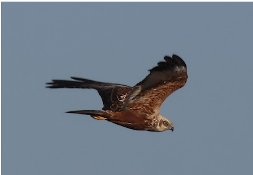
Marsh Harrier at Nickoll's Quarry

Snipe numbers also returned to normal, though 8 in the Lympe / Pedlinge area on the 1 st were clearly left over from the January influx, and the peak count for the rest of the month was 7 at Nickoll's Quarry on the 15 th .