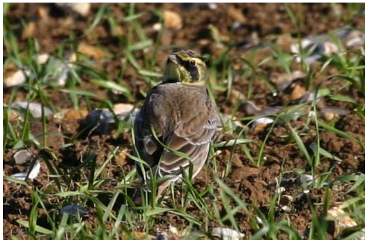
Shore Lark at Abbotscliffe