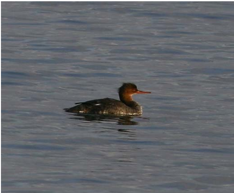
Red-breasted Merganser at Seabrook (Ian Roberts)

Wildfowl are often a feature of colder weather and this was again the case, including a small influx of Goosander . One was on the sea off Hythe on the 27 th , when another 3 flew east there, and a flock of 5, perhaps involving the same birds, were off Seabrook the next day. Finally another was at Botolph's Bridge on the 29 th . A Goldeneye and 2 Scaup were on the sea off the Willop Outfall on the 27 th and a Red-breasted Merganser was off Seabrook on the 29 th .