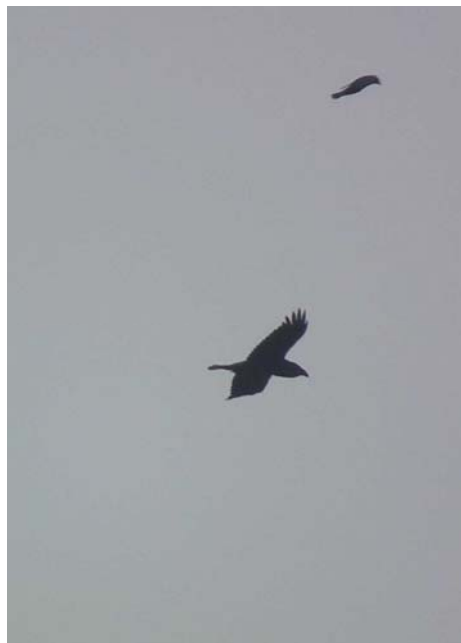
Raven at Samphire Hoe