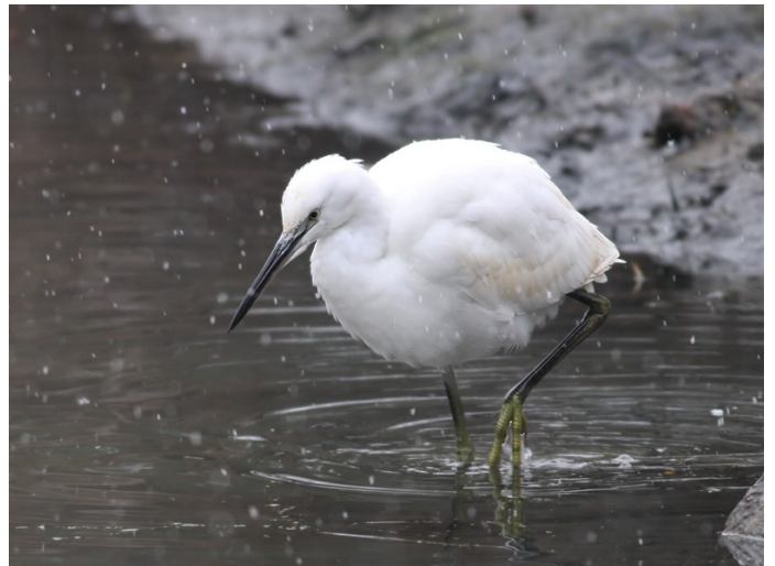
Little Egret at Botolph's Bridge (Brian Harper)