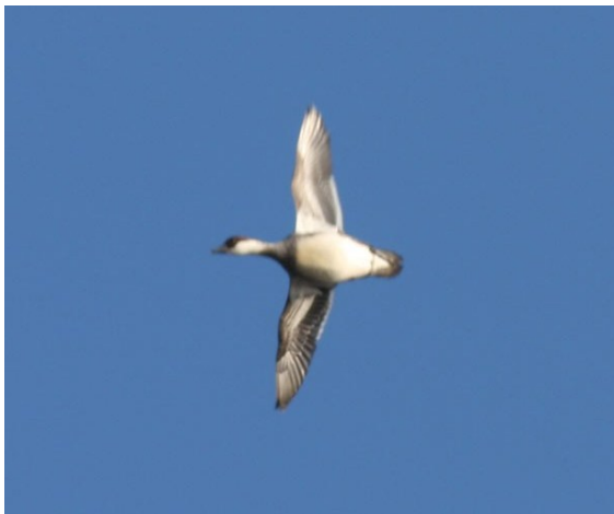
Smew at Botolph's Bridge (Brian Harper)

Mute Swan numbers remained low but increased slightly to a peak of 29 along Donkey Street on the 7 th , and few geese were seen despite the cold weather: 2 Greylag Geese flew west over Hythe Roughs on the 4 th , 3 Canada Geese were near Botolph's Bridge on the 21 st and Brent Geese flew east past Hythe on the 4 th (1) and 12 th (2). Fewer ducks were seen than in January, though 2 Wigeon, 6 Gadwall, 6 Pochard, 7 Teal and 18 Tufted Ducks were at Nickoll's Quarry on the 1 st and the Botolph's Bridge area held 2 Wigeon, 2 Teal, 3 Pochard and 4 Tufted Ducks on the 14 th /15 th , with 2 'red-head' Smew and an amazing flock of 12 Goosanders there on the 20 th . Elsewhere a female Tufted Duck arrived at Samphire Hoe on the 3 rd and remained all month – an unusual record for the site. The 4 Eider seen in January remained off Hythe until the 1 st , whilst 5 Common Scoter were seen there on 8 th , and four Red-breasted Mergansers were off Copt Point on the 14 th .