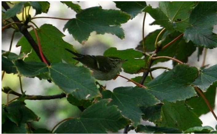
Yellow-browed Warbler at Samphire Hoe (Ian Roberts)

On the 15 th the wind edged round to the north and a Ring Ouzel, a Blackcap, a Reed Bunting, a Grey Wagtail, 3 Chiffchaffs, 4 Redwings, 4 Song Thrushes, 9 Stonechats and 11 Goldcrests were at Samphire Hoe whilst a Redpoll, 14 Siskins, 90 House Martins and 265 Goldfinches flew east. The wind strengthened on 16 th and the temperature began to fall but this brought a Lapland Bunting to Abbotscliffe, where a Redwing, 2 Chiffchaffs, 2 Blackcaps, 3 Song Thrushes and c.100 Swallows were also seen, whilst a Redshank, a Great Spotted Woodpecker, 5 alba wagtails, 9 Redpolls, 9 Greenfinches, 11 Tree Sparrows, 14 Linnets, 32 Siskins, 113 Stock Doves and 485 Goldfinches flew east and a Tree Pipit, a Fieldfare and 6 Reed Buntings flew west. Two Grey Wagtails were along the canal at Hythe.