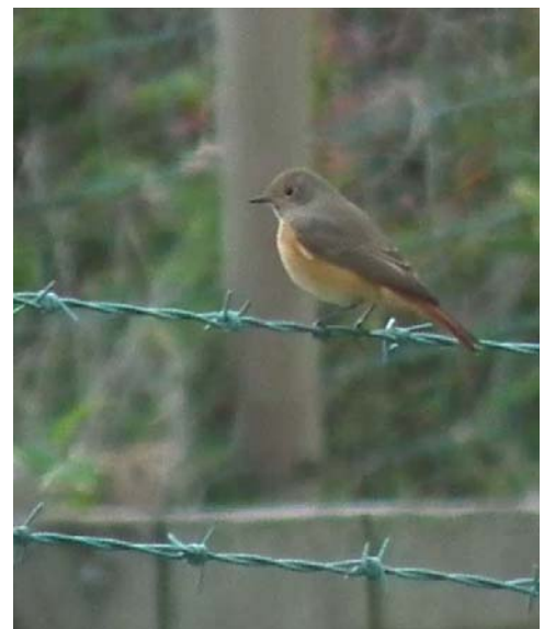
Redstart at Samphire Hoe (Paul Holt)

The wind then increased from the north and temperatures fell again (to as low as 14 Celsius on the 26 th ), which brought the first 6 Redwings of the autumn to Samphire Hoe on the 25 th , when a Common Sandpiper, 2 Song Thrushes, 4 Black Redstarts, 6 Blackcaps, 9 Stonechats and 13 Chiffchaffs were also present. The following day saw a Black-throated Diver fly west past Samphire Hoe and 15 Wigeon flew east there, with another 21 going east along the cliff-top at Abbotscliffe. The Hoe also produced 6 Song Thrushes. On the 27 th a Marsh Harrier, a Redstart, a Reed Warbler, a Grey Wagtail, 2 Ravens, 3 Redwings, 5 Blackcaps, 8 Chiffchaffs and many Robins were at Samphire Hoe, and 20 Siskins flew east, whilst a Swift, a Redwing, a Great Spotted Woodpecker, a Goldcrest, 2 Jays, 4 Chiffchaffs, 7 Song Thrushes, 10 Goldfinches, 14 Yellowhammers, 16 Blackcaps, 24 Robins and 29 Linnets were at Abbotscliffe. A large number of House Martins and Swallows were feeding along the cliffs during this period but the only estimate attempted was 800 of the former at Samphire Hoe on the 26 th .