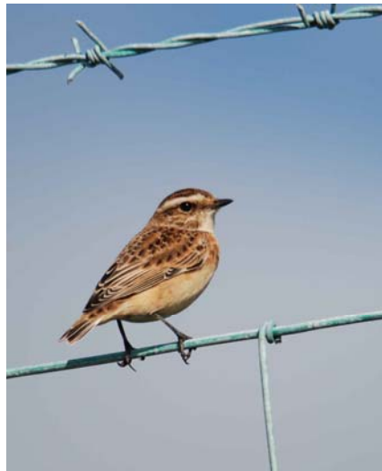
Whinchat at Samphire Hoe