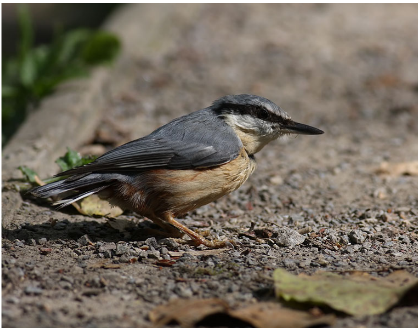
Nuthatch at Brockhill CP

Another lull followed but this came to a dramatic end on the 15 th with the discovery of a Dark-eyed Junco in a private garden in Folkestone but, despite a three day stay, the first Nearctic passerine for the area was only seen by the residents.