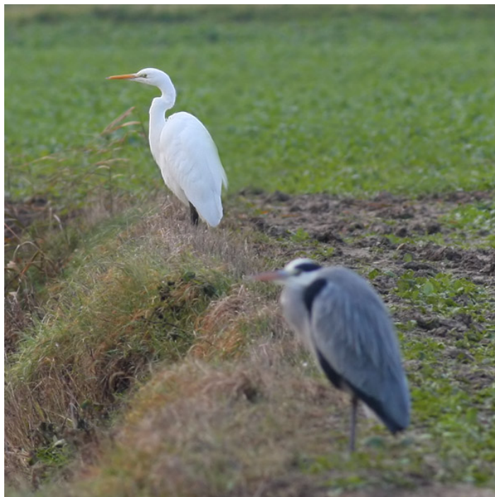
Great White Egret at West Hythe

A flock of 30 Waxwings were found in Hythe on the 1 st and these increased to 39 on the 3 rd , 51 on the 5 th and peaked at an impressive 87 on the 13 th . The birds generally favoured the Prospect Road area and delighted many observers however, with the berry supply diminished, a rapid decrease occurred mid-month though at least 11 were present to the month's end.