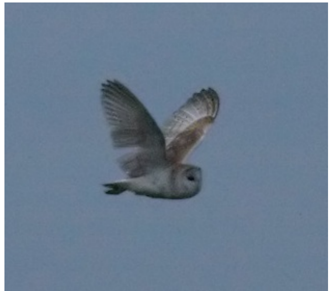
Barn Owl at Nickoll's Quarry

Three Waxwings in the Cheriton / Sandgate area on the 14 th were part of a small influx into the county at this time.