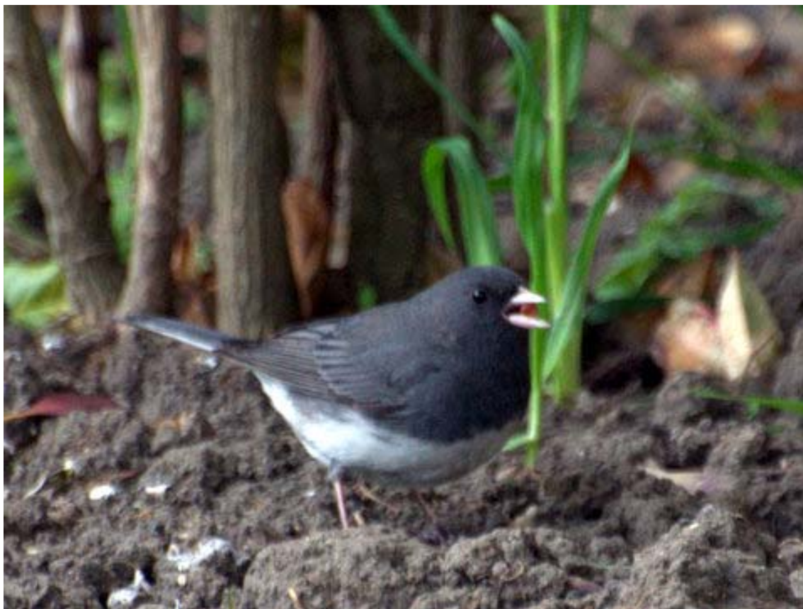
Dark-eyed Junco at Folkestone

Another lull followed but this came to a dramatic end on the 15 th with the discovery of a Dark-eyed Junco in a private garden in Folkestone but, despite a three day stay, the first Nearctic passerine for the area was only seen by the residents.