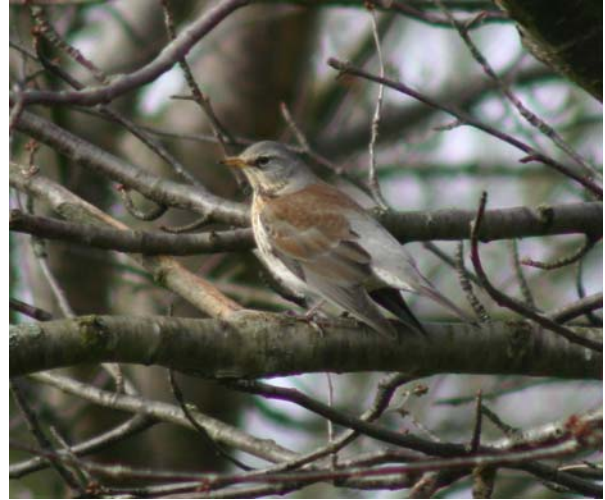
Fieldfare at Folkestone

The weather became more changeable from the 13 th , with rain at times, but migrants began to arrive. Two Red Kites and 2 Buzzards flew over Folkestone, a Woodcock was at Capel-le-Ferne and 30 Siskins flew east at Samphire Hoe. At Nickoll's Quarry a Cetti's Warbler, 8 Tufted Ducks and 14 Snipe were noted. A female Garganey and a Firecrest were at Castle Hill Reservoir the next day, and another Firecrest was at Abbotscliffe on the 16 th . The 17 th produced a Black Redstart and a Chiffchaff at Samphire Hoe, and 3 Brent Geese flew east, whilst the first 2 Wheatears arrived there on the 19 th . Another Wheatear was at Abbotscliffe the next day and 2 Water Rails, 2 Blackcaps and 4 Chiffchaffs were along the canal at Seabrook, where a Peregrine flew over. Several migrants Redwings and Fieldfares were noted at coastal sites.