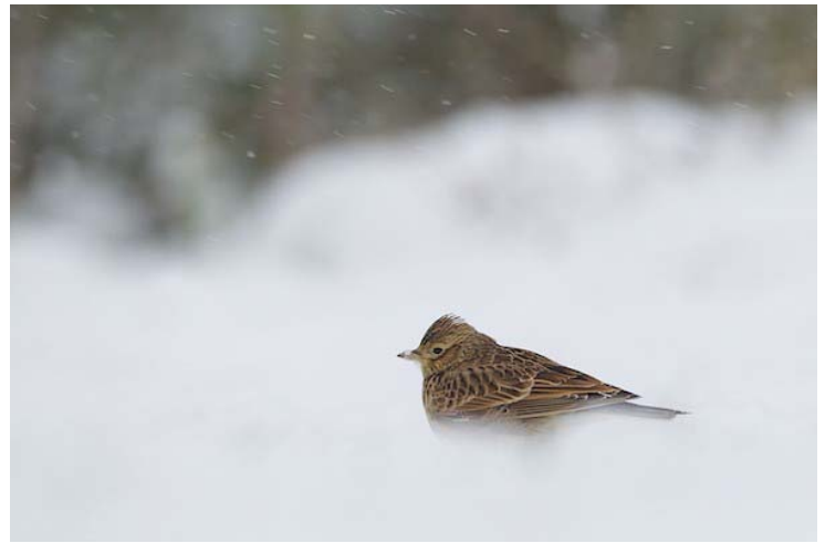
Displaced by the cold: a Dunlin on the seawall at Samphire Hoe and a Sky Lark in the snow at East Cliff, Folkestone

Other early highlights included a Crane at the Willop Outfall on the 5 th and the continuing residence of the Great White Egret in the Botolph's Bridge / West Hythe area (to the year's end). Little Egrets were recorded at Samphire Hoe, West Hythe and the Willop Sewer (2) all on the 5 th and a count of 9 Grey Herons at the Willop Sewer on the same day was noteworthy, whilst 4 flew west over Hythe on the 1 st . Cormorants continue to use West Hythe as a daytime roost and reached a peak of 36 on the 5 th . A Little Gull was seen off Hythe on the 2 nd and 1,500 Black-headed Gulls were counted at Nickoll's Quarry on the 1 st .