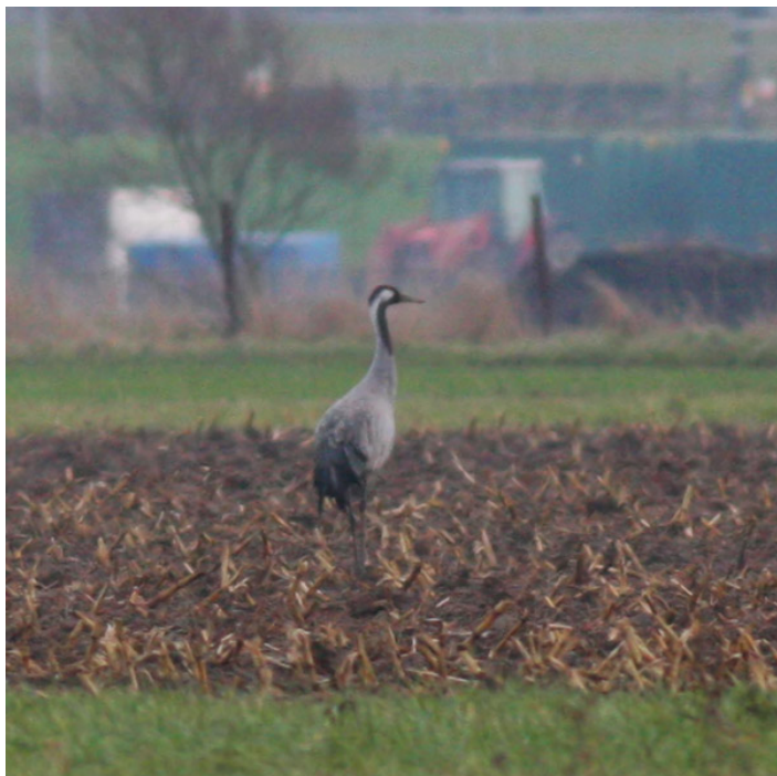
Crane at the Willop Outfall