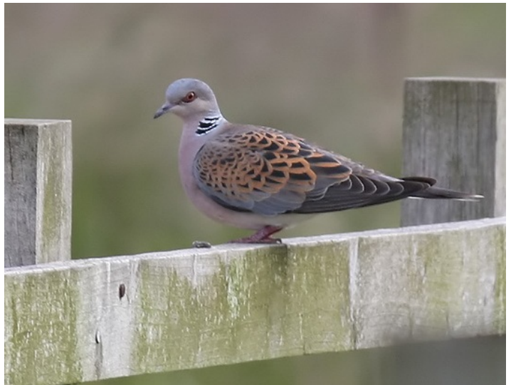
Turtle Dove at Botolph's Bridge (Brian Harper)

There was some evidence of continuing arrivals, including a Cuckoo which wandered into a Hythe garden on the 2 nd and out-of-habitat Reed Warblers near Newington on the 17 th and Hockley Sole (Capel-le-Ferne) on the 20 th . Groups of 150 Swifts at Capel-le-Ferne on the 12 th and 80 at Samphire Hoe on the 20 th were most likely to be feeding flocks, whilst a Hobby at Abbotscliffe on the 15 th could have been a migrant or a local breeder.