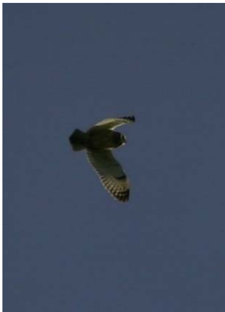
Short-eared Owl at Abbotscliffe (Ian Roberts)

The wind eased on the 7 th and a Short-eared Owl, a Tree Pipit, a Lesser Whitethroat, 2 Bramblings, 2 Buzzards, 2 Chiffchaffs and 3 Wheatears were at Abbotscliffe and 6 Jays flew east, whilst Samphire Hoe held a Ring Ouzel, a Wheatear, a House Sparrow and 8 Chiffchaffs.