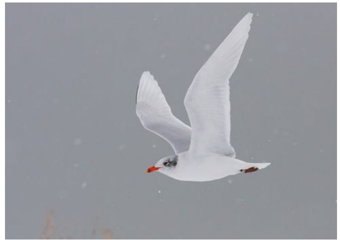
Mediterranean Gulls in the snow at Copt Point

A Barn Owl was watched hunting in the Nickoll's Quarry / Botolph's Bridge area on 3 dates from the 20 th and Little Owls were seen at Samphire Hoe and West Hythe (2). There were single Kingfishers at West Hythe on the 1 st and Botolph's Bridge on the 21 st .