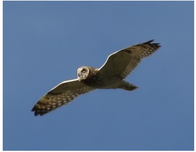
Short-eared Owl at Botolph's (Brian Harper)

On a calmer 21 st a Firecrest, a Goldcrest, a Dunlin, a Lesser Whitethroat, a Whitethroat, 4 Sand Martins, 7 Blackcaps and 30 Chiffchaffs were at Samphire Hoe and 2 Buzzards flew over Church Hougham. The 22 nd saw temperatures climb back to 21 Celsius which even coaxed a Grasshopper Warbler into song at Abbotscliffe, where a Redstart, a Hobby, a Song Thrush, a Blackcap, a Whitethroat, 2 Wheatears and 6 Chiffchaffs were also of note, and singles of Grey, Yellow and Pied Wagtail flew west. Samphire Hoe also produced a Grasshopper Warbler, as well as a Swift, a Whinchat, a Whitethroat, a Song Thrush, 3 Wheatears, 5 Blackcaps and 11 Chiffchaffs. Two Wheatears were on the old airfield at Lympe, where there had been up to 6 recently. On a showery 23 rd just a Redstart, a Whitethroat and 2 Whinchats were at Abbotscliffe and similar conditions the next day saw a Spotted Flycatcher in a garden in Folkestone and 4 Chiffchaffs at Capel-le-Ferne Gun Site.