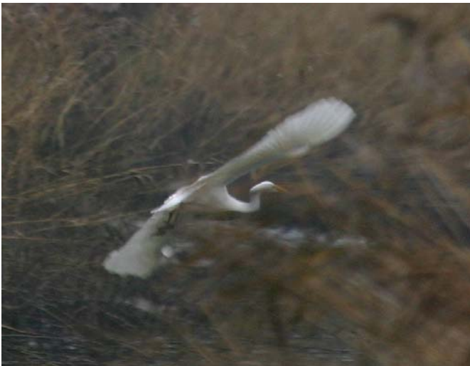
Great White Egret at Botolph's Bridge (Ian Roberts)