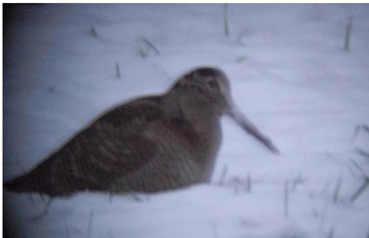
Woodcock in a garden in Folkestone (Mick Vandoen)