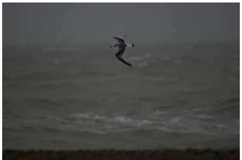
Kittiwake at Folkestone Beach (Ian Roberts)

On the 8 th the wind veered south-easterly and increased to gale force as heavy rain set in. Seawatching from Folkestone was rather productive with a Sandwich Tern, 2 Arctic Skuas, 2 Grey Plovers, 3 Pomarine Skuas , 3 Bar-tailed Godwits, 8 Turnstone, 9 Great Skuas, 14 Red-breasted Mergansers, 14 Little Gulls, 31 Brent Geese, 35 Dunlin, 42 Wigeon, 92 Gannets, 115 Common Scoters and a very good count of 908 Kittiwakes, mostly flying east. At times the Kittiwake passage was very heavy and further to the east 230 were logged going past Samphire Hoe in just 30 minutes. The majority of birds were very close in and some Kittiwakes were even passing over the beach. A Little Gull was also seen off Sandgate Castle.