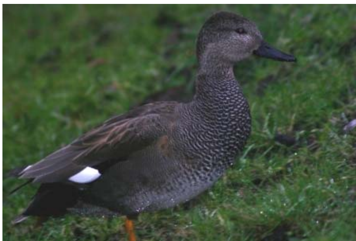
Gadwall at Hythe Canal