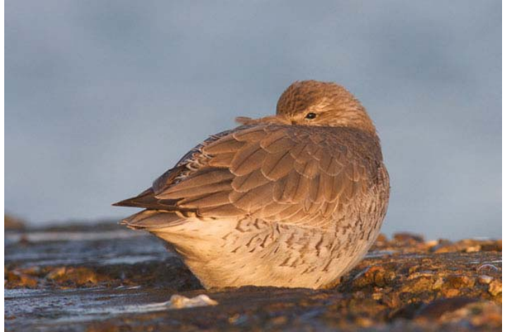
Knot at Folkestone Warren (Dave Featherbe)

Single Kittiwakes were noted off Hythe on the 8 th and Mill Point on the 23 rd , and 20 Razorbills flew west past the former site on the 8 th .