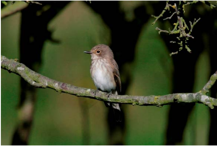
Spotted Flycatcher at Abbotscliffe (Dale Gibson)

The long-staying Lapland Bunting had departed the gully on the 19 th but another flew in off the sea at Abbotscliffe, whilst 2 were found in stubble at the eastern end. Otherwise it was quieter in a freshening south-westerly, with only a Firecrest, 5 Chiffchaffs and 6 Wheatears of note there. The wind continued to increase on the 20 th and attention turned to the sea, where a Black Tern, a Great Skua, 2 Sandwich Terns and 16 Common Terns flew west past Copt Point. However a Firecrest was also seen, at Enbrook Park (Sandgate).