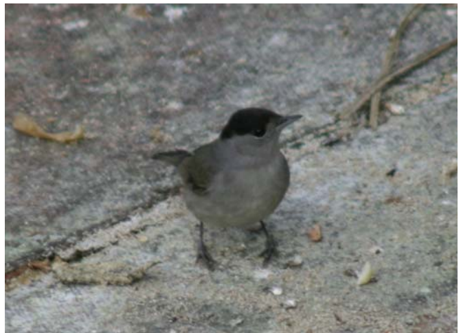
Wintering Black Redstart and Blackcap at Hythe (Ian Roberts)