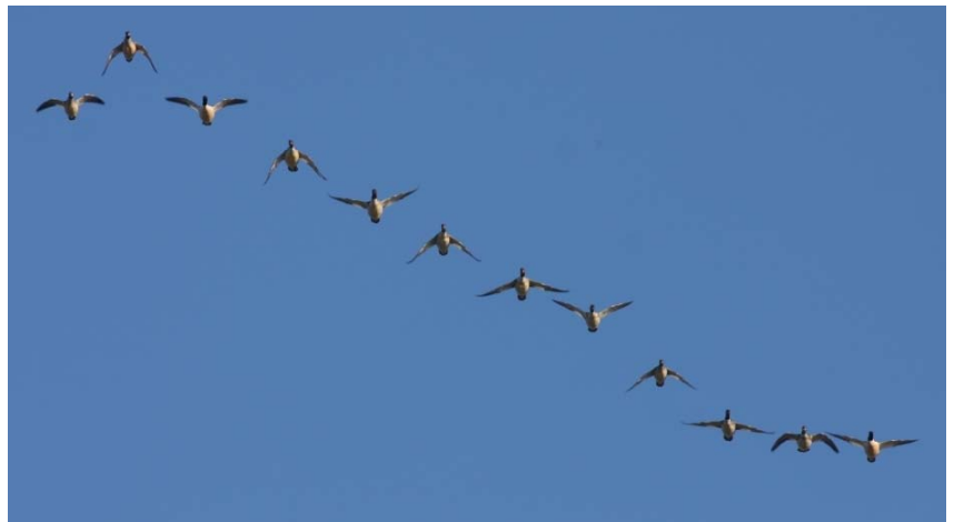
Goosanders at Botolph's Bridge (Brian Harper)

35 Red-throated Divers and 50 Great Crested Grebes were off Hythe on the 8 th , when a Fulmar and 18 Gannets flew east, and 3 Fulmars flew east past Mill Point on the 23 rd , whilst others were back at breeding sites on the cliffs. A flock of 11 Cormorants flew east past Hythe on the 12 th and a Shag was at Copt Point on the 1 st . The Great White Egret and 2 Little Egrets remained in the West Hythe area throughout.