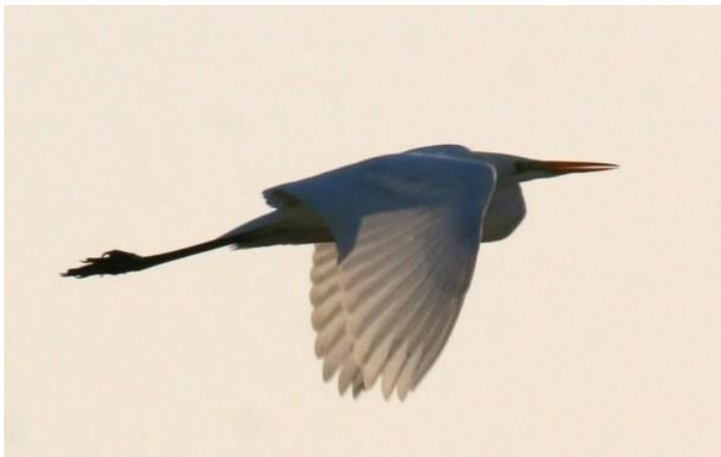
Great White Egret at West Hythe (Dale Gibson)

Elsewhere two were seen and photographed as they flew east past Samphire Hoe on the 5 th July 2011, one was seen at Westenhanger on the 23 rd August 2012 and three flew east distantly past Abbotscliffe on the 17 th May 2014.