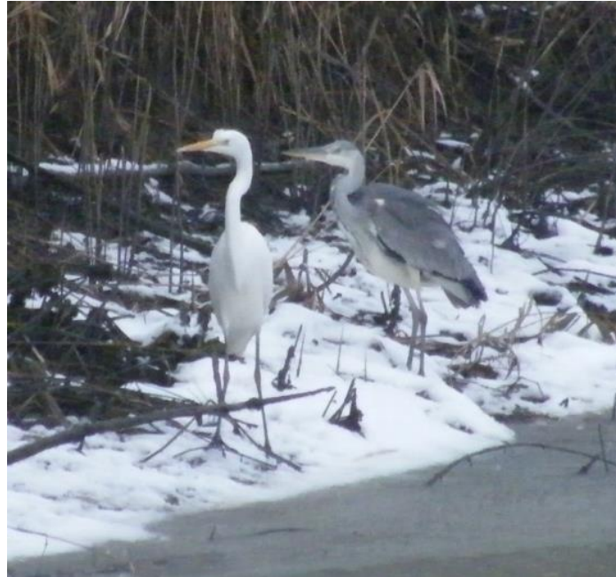
Great White Egret with Grey Heron at West Hythe

The record was accepted by KOS rarities committee.