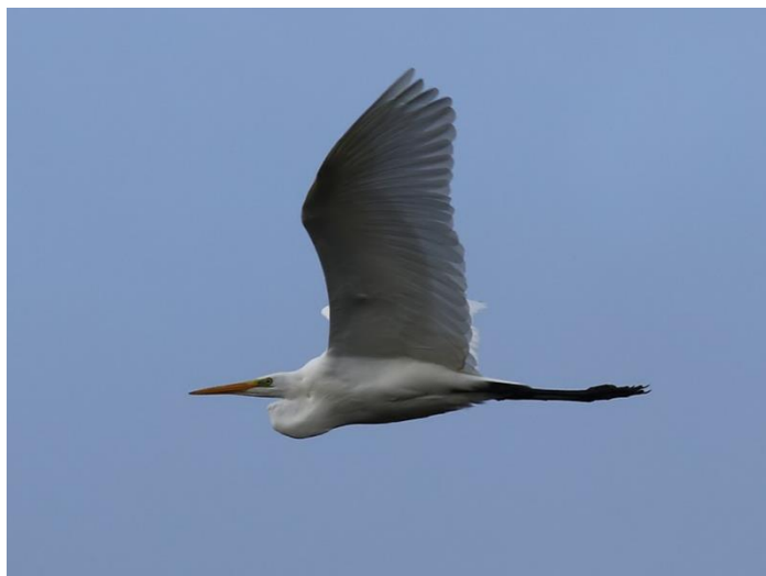
Great White Egret at Botolph's Bridge (Brian Harper)