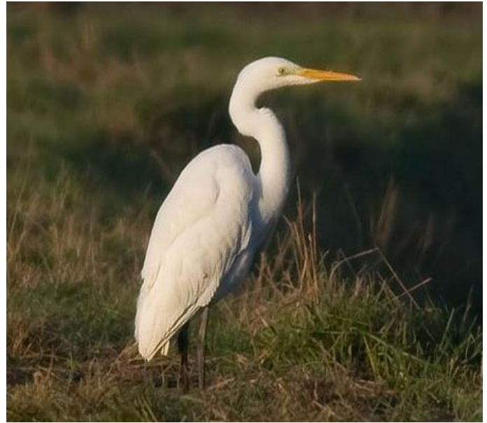
Great White Egret at Botolph's Bridge

It was a former vagrant to the county but is now a regular annual visitor, predominately during the winter months.