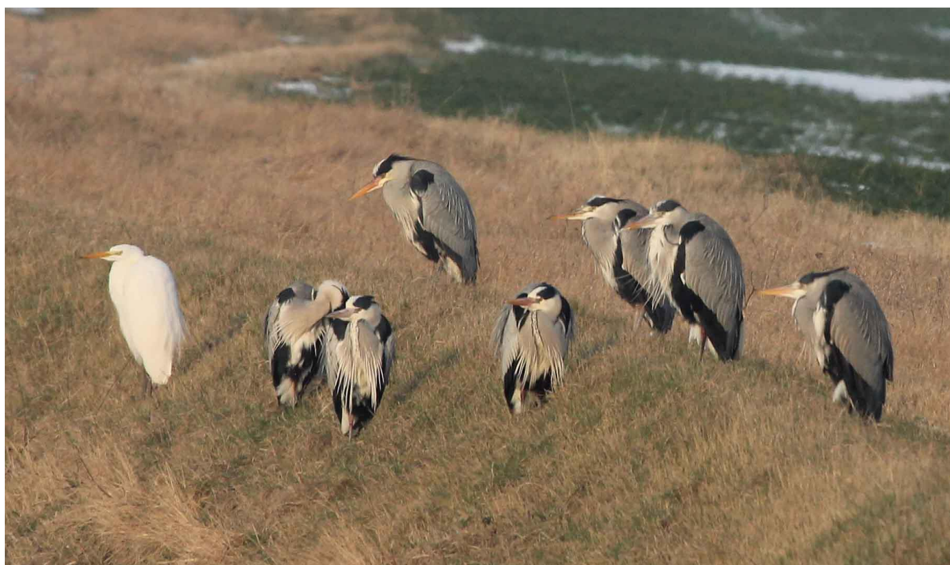
Great White Egret with Grey Herons at West Hythe (Ian Roberts)