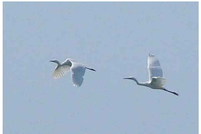
Great White Egrets at Samphire Hoe (Colin Fisher)