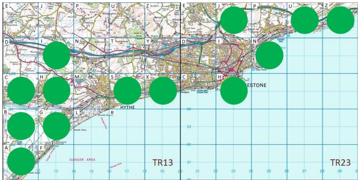
Figure 3: Distribution of all Great White Egret records at Folkestone and Hythe by tetrad

Figure 3 shows the location of records by tetrad.