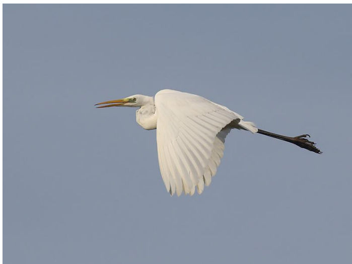
Great White Egret at Donkey Street (Brian Harper)