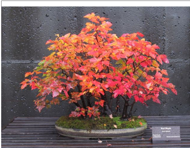
Acer rubrum forest from the NC Arboretum collection.