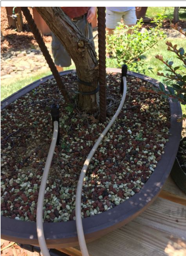
Emitters deliver much needed water to thirsty trees.