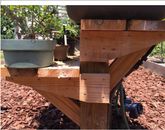
Detail view of Ron's very well-built display bench