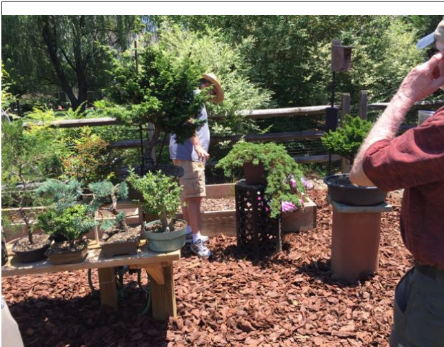
We've previously noticed how weed-free some gardens are. Yet another great example!