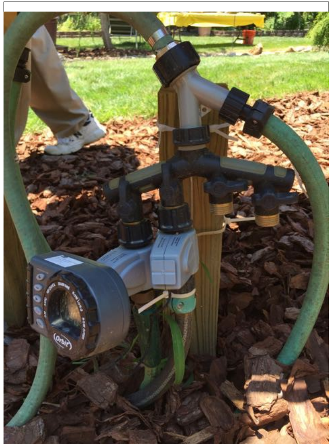
A close-up of one of Ron's automated watering setups. Ron is obviously an advanced craftsman, using zip-ties rather than Duct Tape for holding everything together!