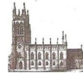
St Mary's in the Marketplace

Our "Phase 6" appeal remains open, the more funding we receive the more work can be undertaken whilst we have the approvals to do so. Our existing facility permissions do have a time-frame for work to be completed so it is important to do as much as we can at this time and whilst the contractors are on-site. We have also been able to authorise some additional lighting to be purchased for the Rector's vestry (additional electrical sockets to also be provided) The next step is to review more fully the heating in that area – heating and lighting being a "top" requirement for the room to be fully utilised – and to determine what funds will allow us to do.