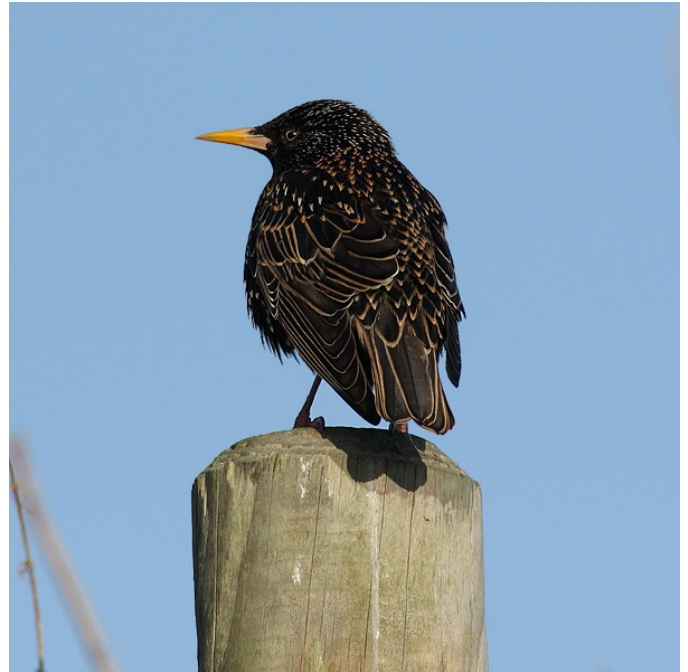
Starling at Seabrook (Brian Harper)

The full species account will follow but the breeding and wintering distribution maps based on the 2007 – 2012 BTO / KOS atlas are provided below.