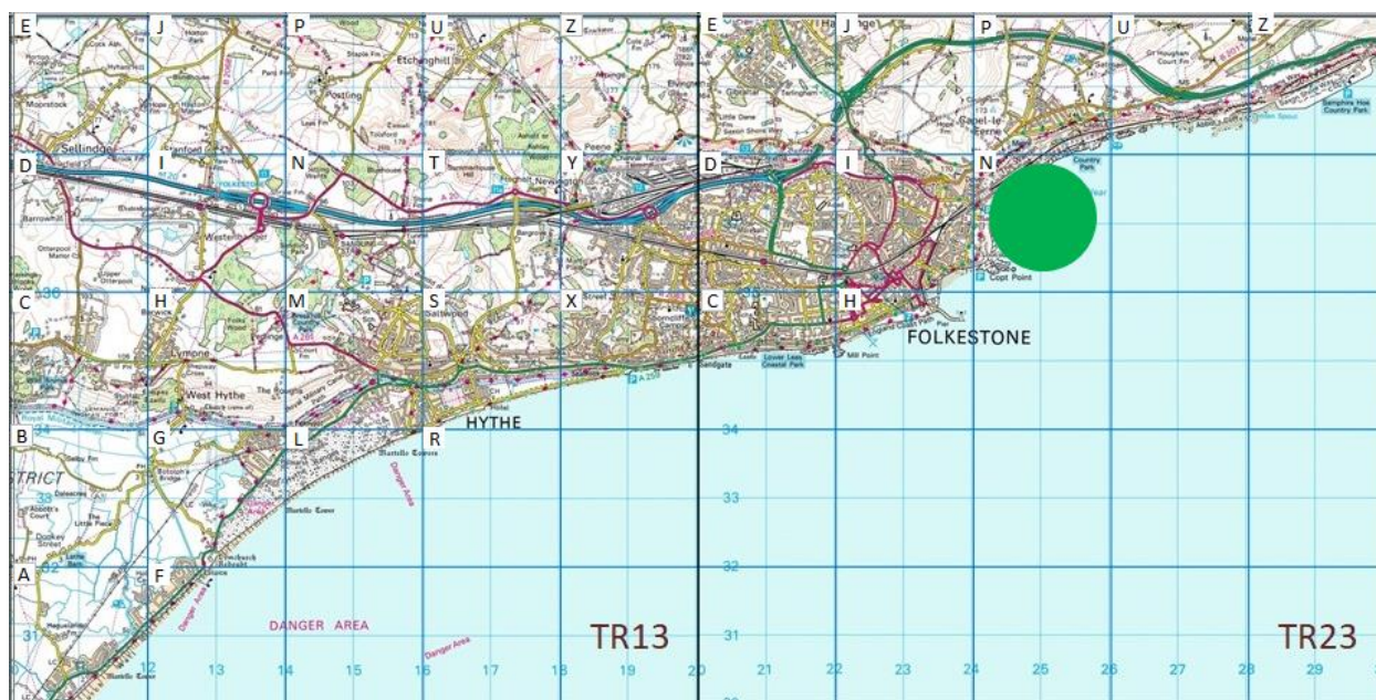
Figure 2: Distribution of all Lesser Crested Tern records at Folkestone and Hythe by tetrad

Figure 2 shows the location of the record by tetrad.