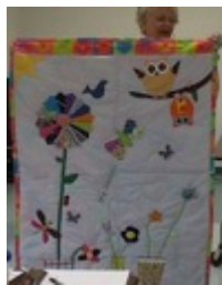
Bev Schewanick's UFO Flowers and Owl Donation Quilt