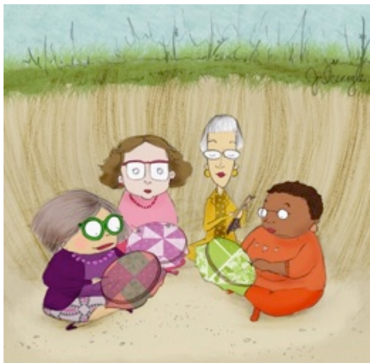
Stich in the Ditch Club